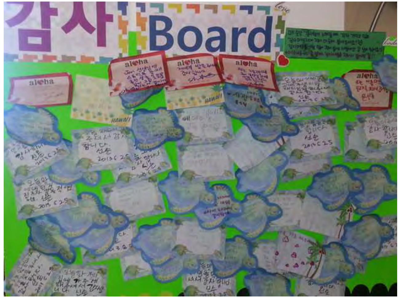
True Grandchildren Divine Principle Workshop - Thank Message Board