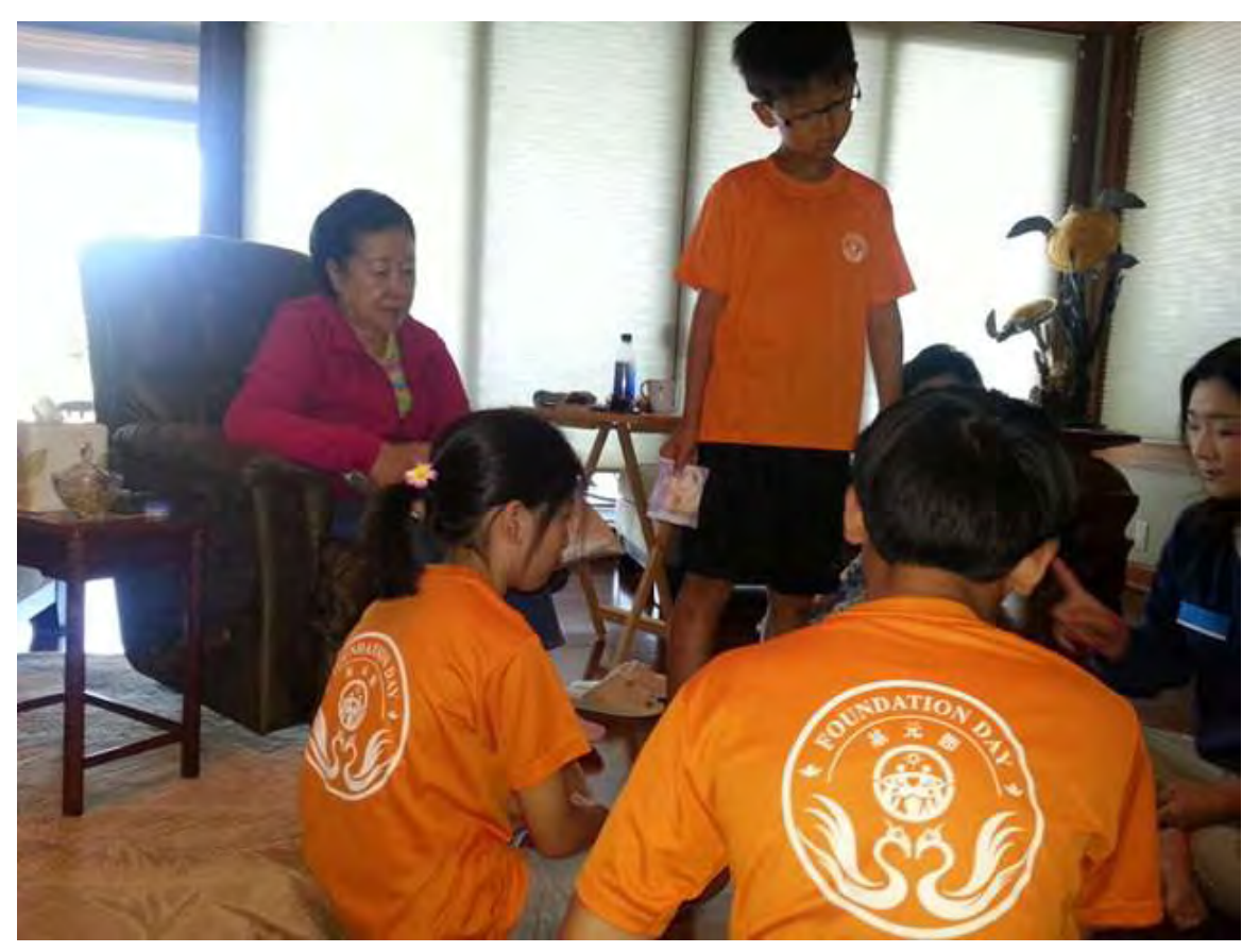
True Grandchildren Divine Principle Workshop