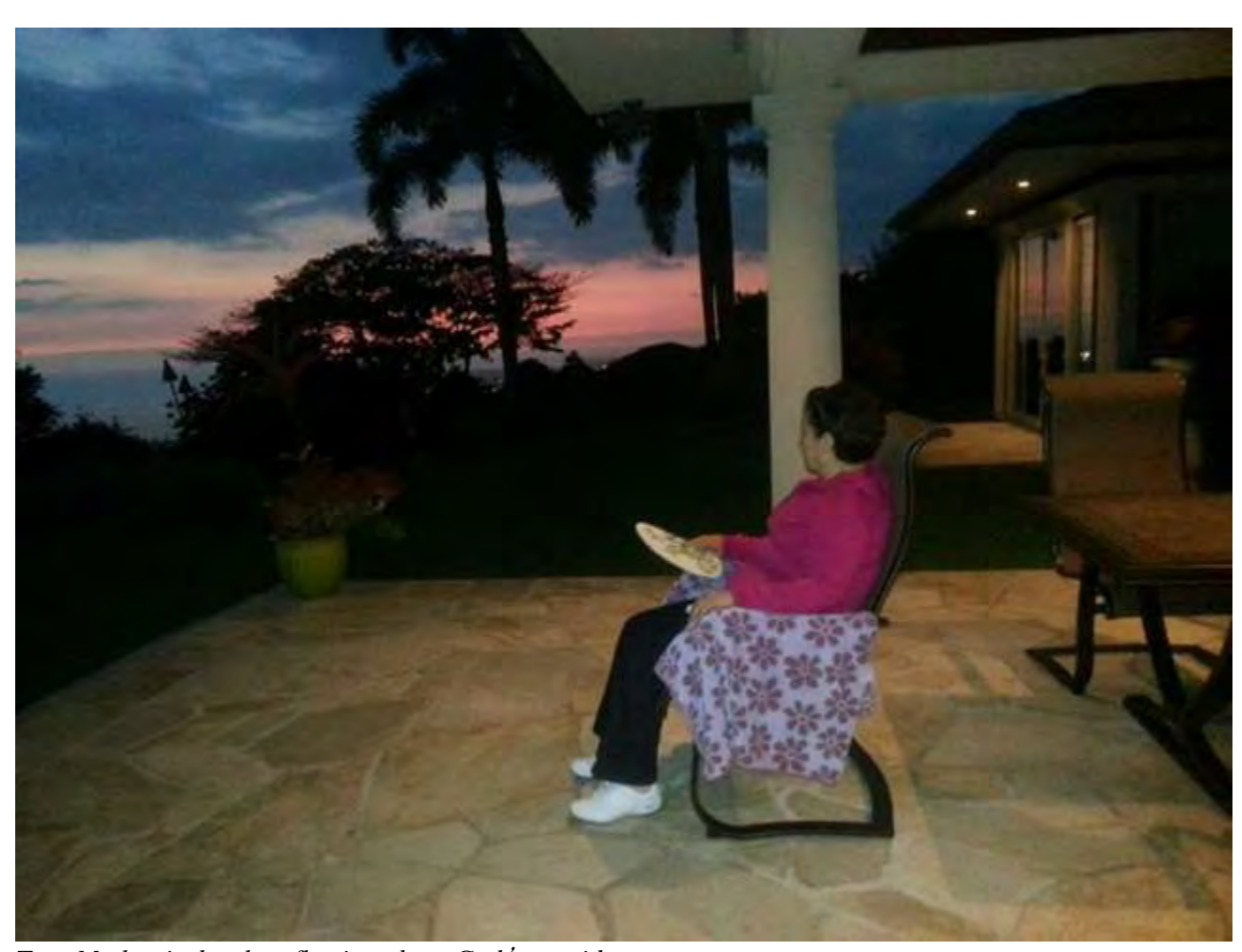
True Mother is deeply reflecting about God's providence

True Mother emphasized the importance of God's providence during the leaders' meeting in Kona, Hawaii. She mentioned the needs to raise 2nd Generation leaders and thorough future preparation.