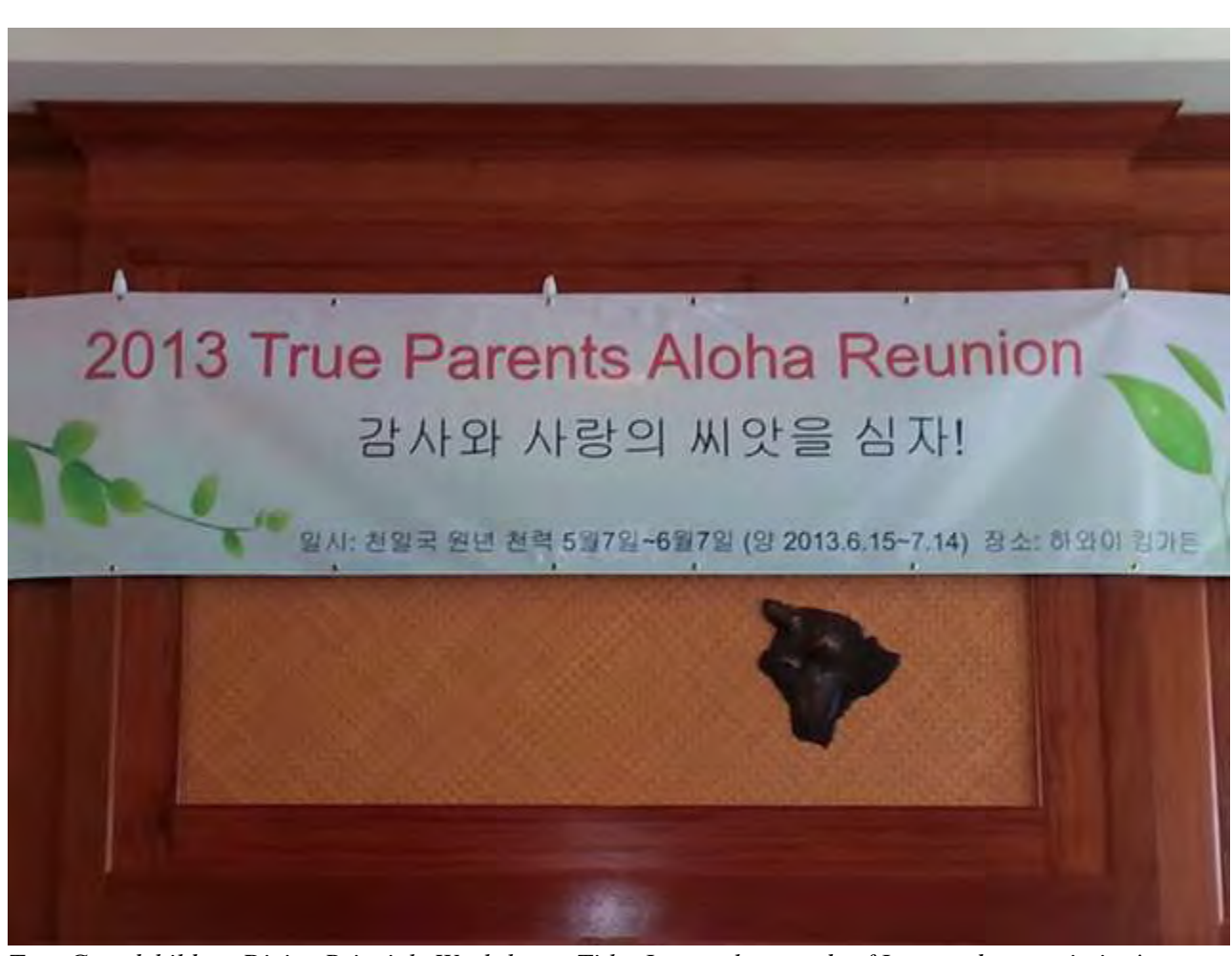
True Grandchildren Divine Principle Workshop - Title: Let us plant seeds of Love and appreciation!