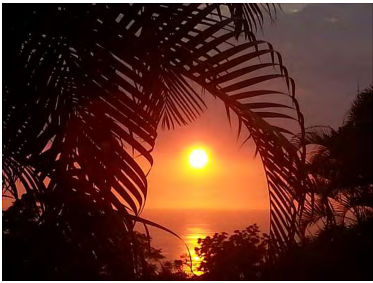
Sunset of Kona, Hawaii