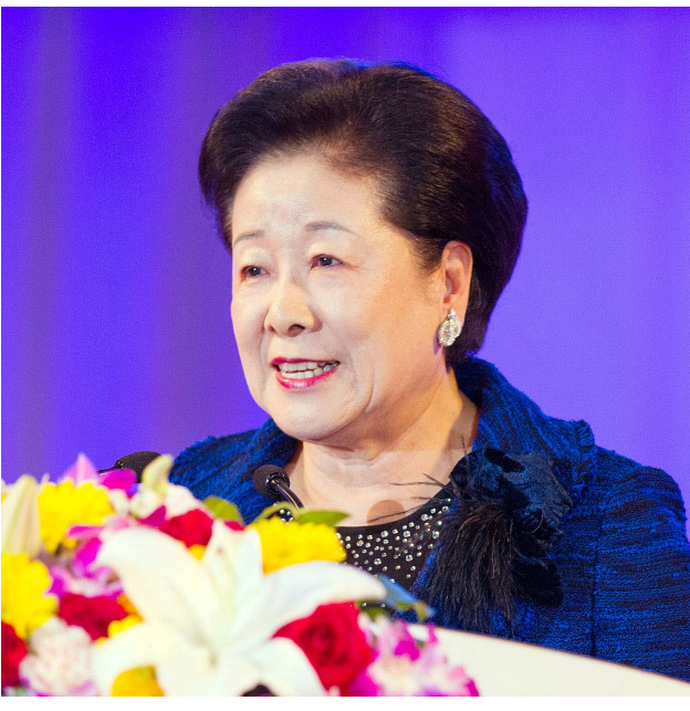
True Mother giving her message

We sometimes come across a pair of ants with their mouths connected. A theory says that it is an act of giving nutrients to the other ant. The life of ants, thus, embodies a spirit of mutual cooperation.