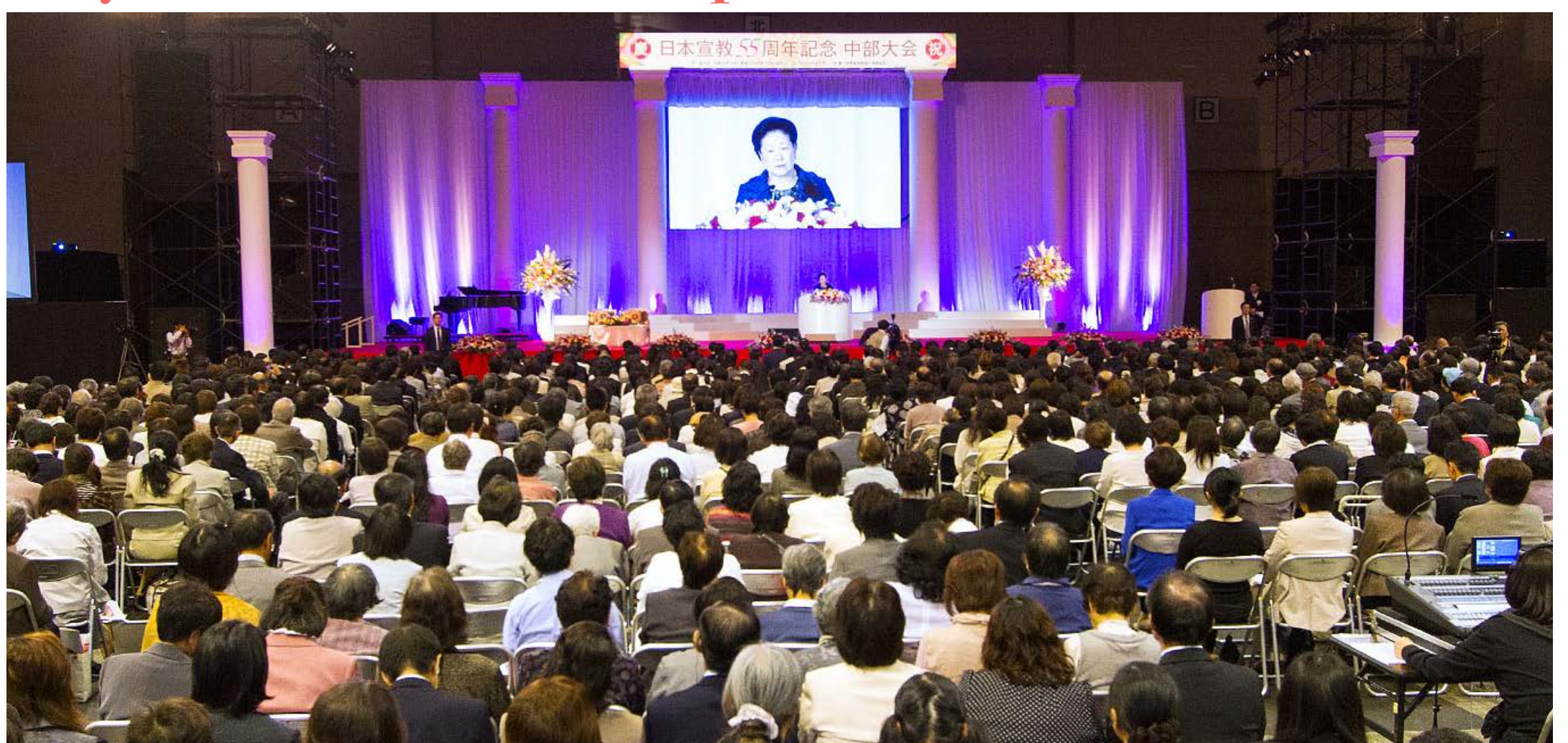
About 10,000 people took part in Central Japan Rally

The Japanese people work like ants - a fact or a myth, it is widely assumed. True Mother also acknowledges this ants' nature, not because ants are merely hard working, but they are attentive to their peers and act like serving other insects or animals. True Mother appreciates Japan from such perspectives.