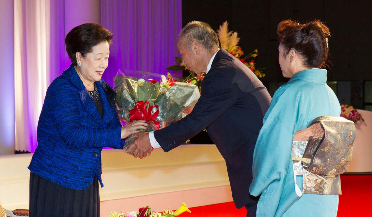
The Mukami couple offers a bouquet of flowers to True Mother