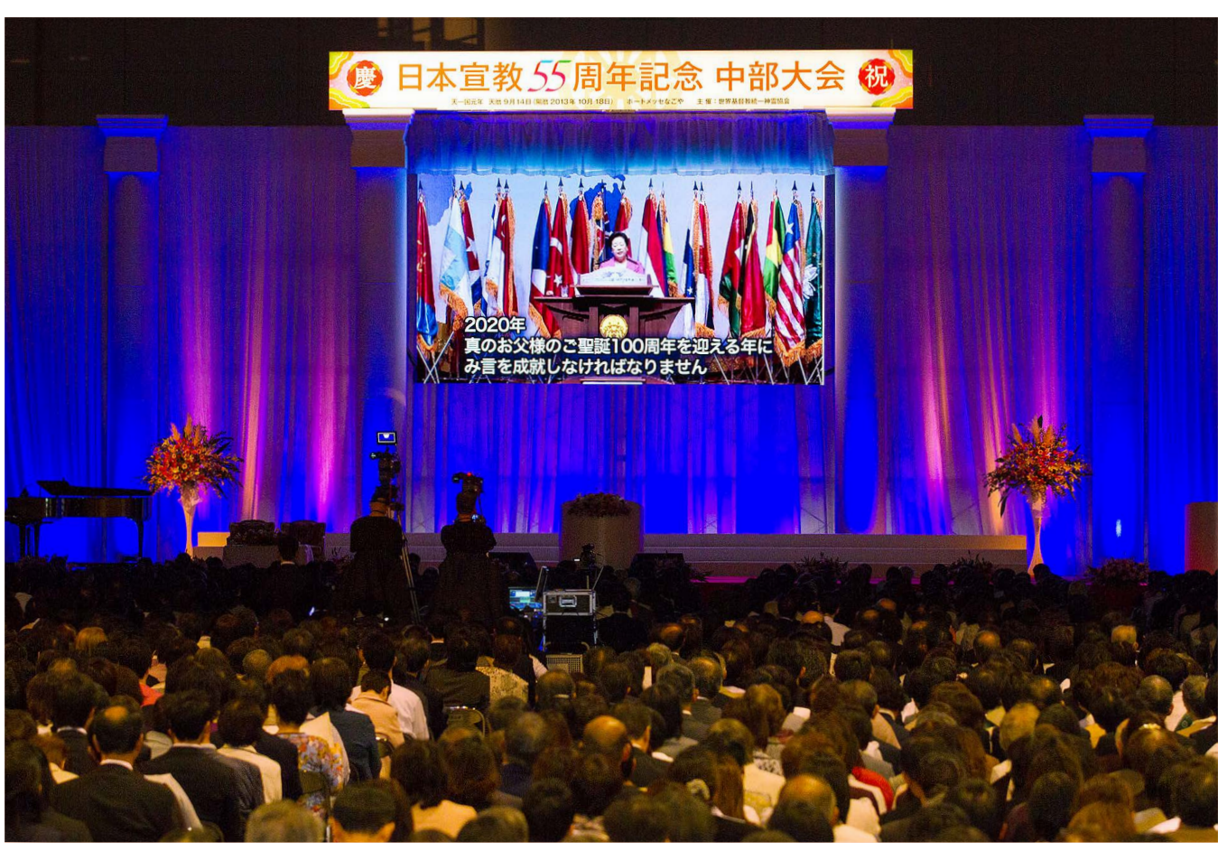
A view from the Central Japan Rally