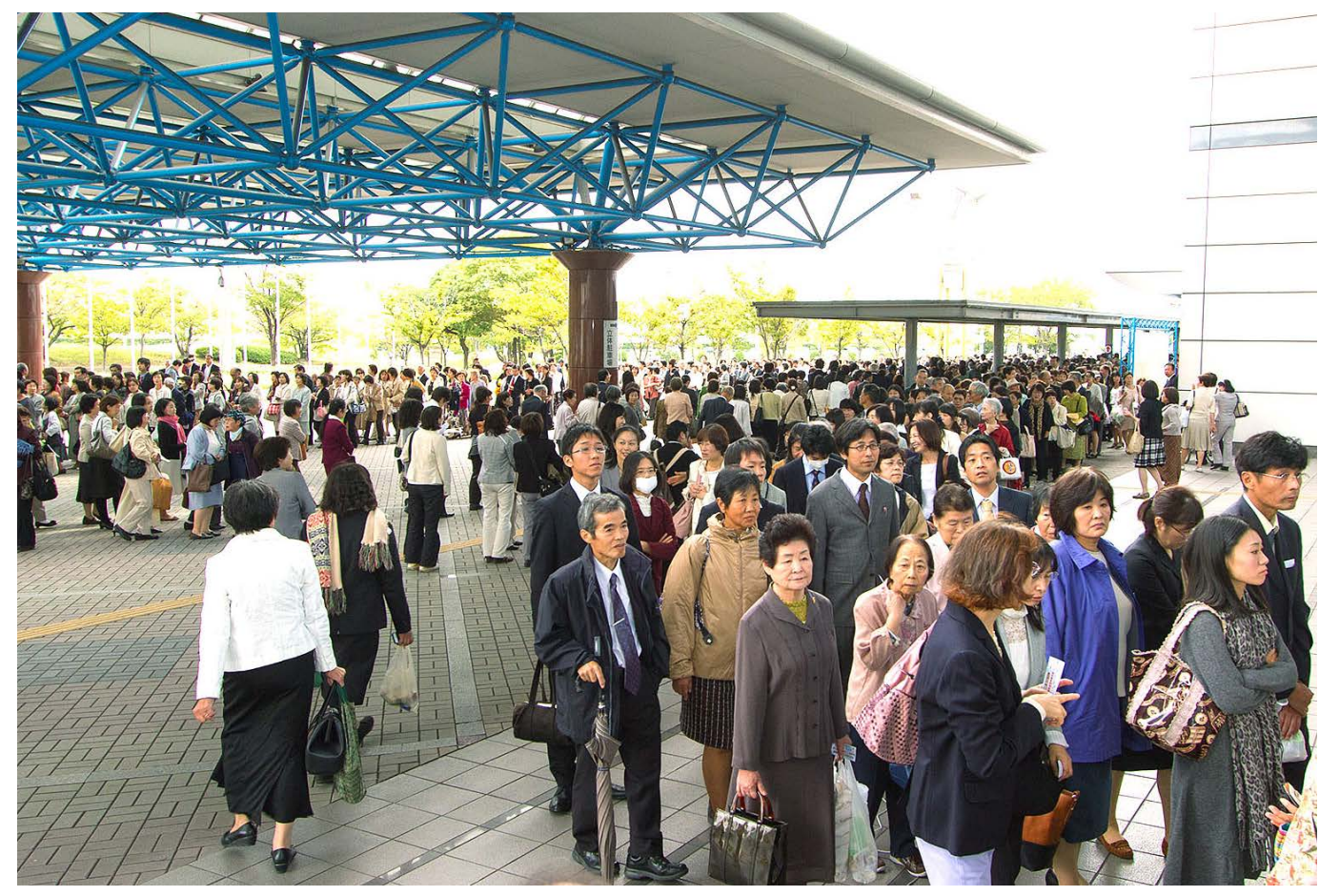
Participants waiting in a long line