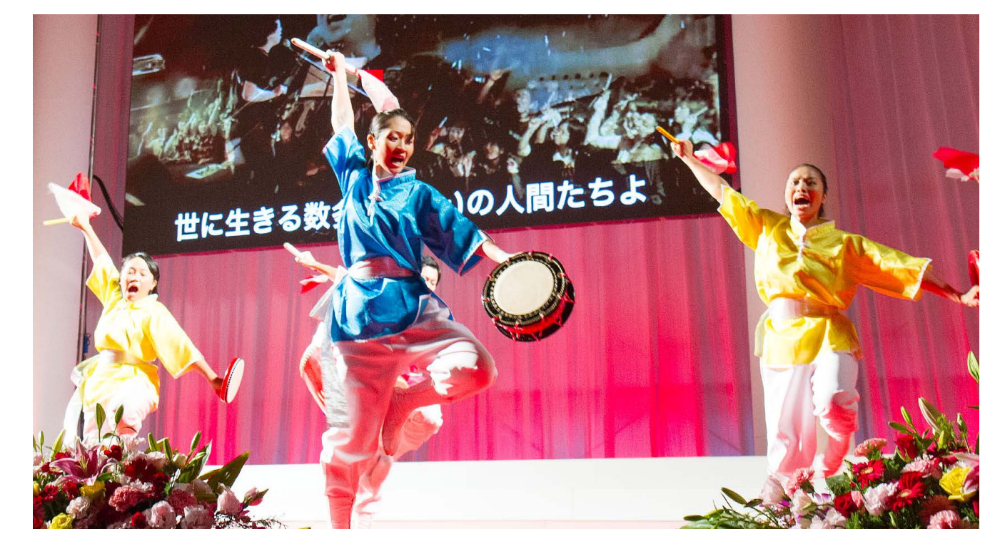
Energetic drum dance by members of 7th and 8th Regions