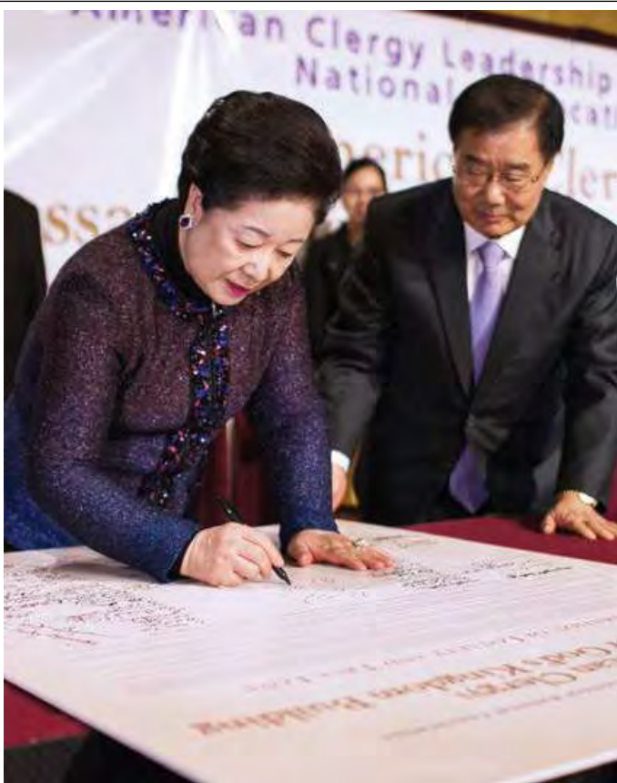
Mother adding her signature to a board signed by the ACLC National Convocation attendees

That is why the people of Israel clung to Heaven desperately. God did what he promised he would do. If the people of Israel at the time had fulfilled their responsibilities and become one with Jesus, what do you think would have happened?