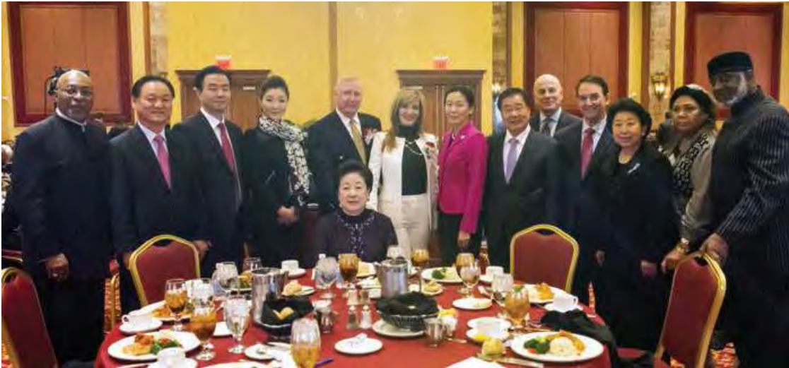
Mother with some key figures at the ACLC event

providence and have therefore stood in a public position, or whether they have sought their own salvation above anything else. The world is celebrating the coming Christmas week. Are there any among you who asked why Jesus had to choose the path of the cross even though so many people had endured hardships in order that he could be born? It was because of the circumstances at the time... The well-renowned people of the time failed to fulfill their responsibilities.