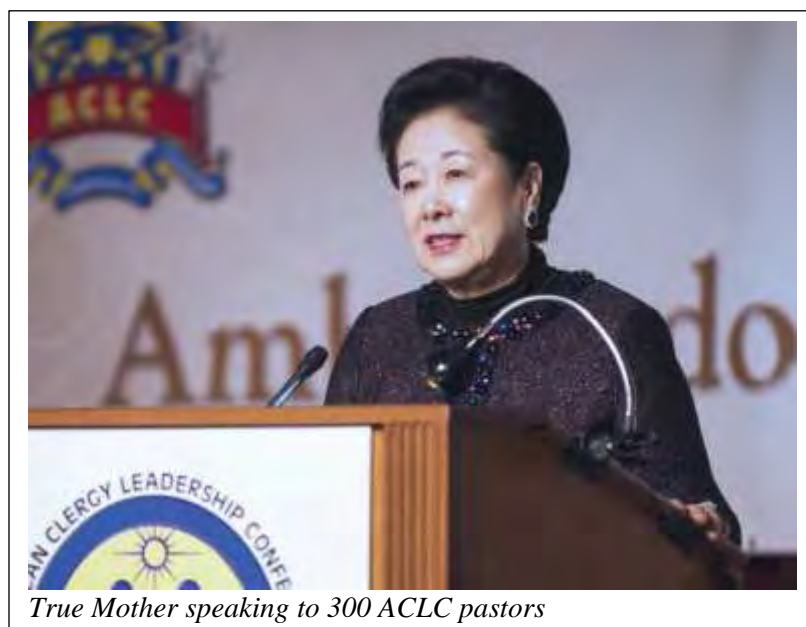
True Mother speaking to 300 ACLC pastors

You all have the title of minister of religion, isn't that so? Minister of religion... That is not an easy job. Am I right or wrong about that?