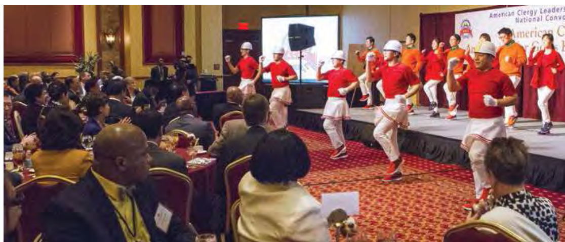
Entertainment during the ACLC luncheon

Many who listened to the voice of their conscience joined this movement and were grateful to have done so.