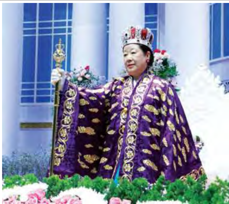
February 22, 2013 True Mother proclaiming Cheon Il Guk Foundation Day

Mother undertook a special forty-day devotional period. During this time, she set the direction of the providence. She encouraged all members by saying, "We shall be well organized and move forward with one heart and one purpose centering on the Principle. Do you understand what I mean? Those who resolve to do so, clap your hands to show it, and to congratulate True Father for his new beginning." Following that worship service on the fortieth day after True Father's ascension, True Mother embarked on a holy ground pilgrimage in the United States. This pilgrimage covered more than 5,600 kilometers (3,500 miles).