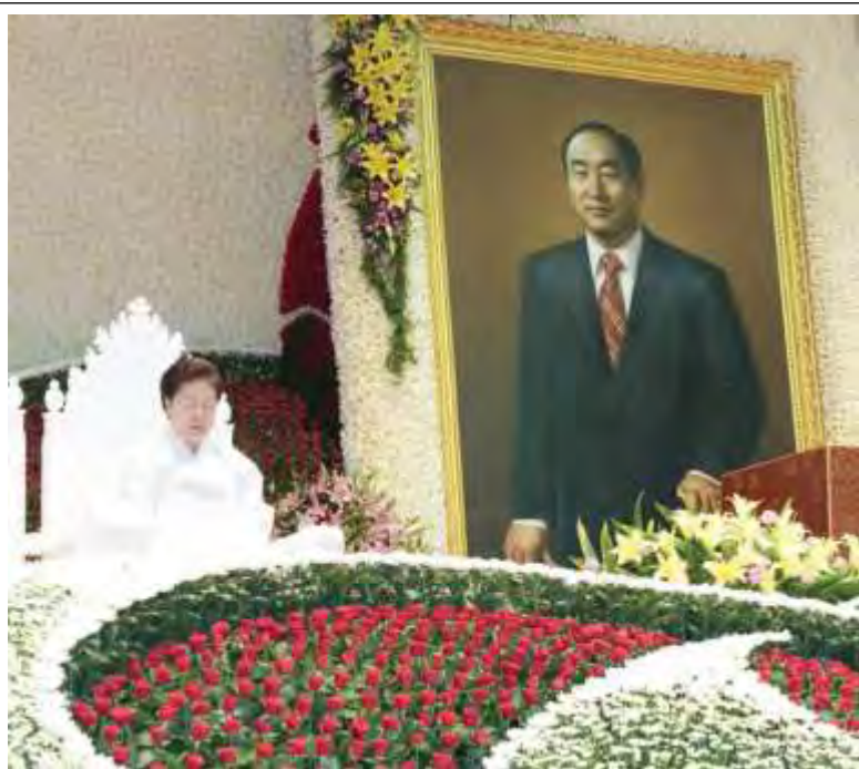
True Mother praying at the Universal Seonghwa Ceremony for Sun Myung Moon, the True Parent of Heaven, Earth and Humankind on September 15, 2012 in the Cheongshim Peace World Center

Mother undertook a special forty-day devotional period. During this time, she set the direction of the providence. She encouraged all members by saying, "We shall be well organized and move forward with one heart and one purpose centering on the Principle. Do you understand what I mean? Those who resolve to do so, clap your hands to show it, and to congratulate True Father for his new beginning." Following that worship service on the fortieth day after True Father's ascension, True Mother embarked on a holy ground pilgrimage in the United States. This pilgrimage covered more than 5,600 kilometers (3,500 miles).