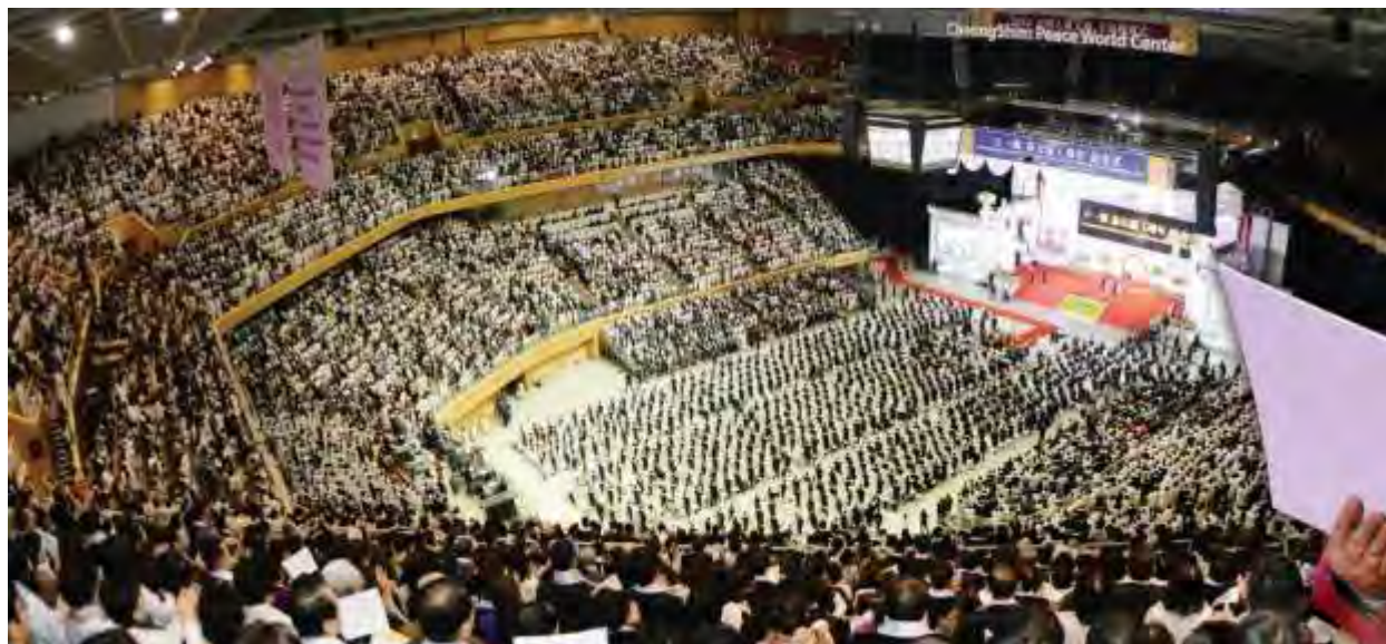
True Mother promulgates the Cheon Il Guk Constitution on the first anniversary of Foundation Day held in the Cheong Shim Peace World Center on February 12, 2014

She introduced him to our peace initiatives and invited his support.