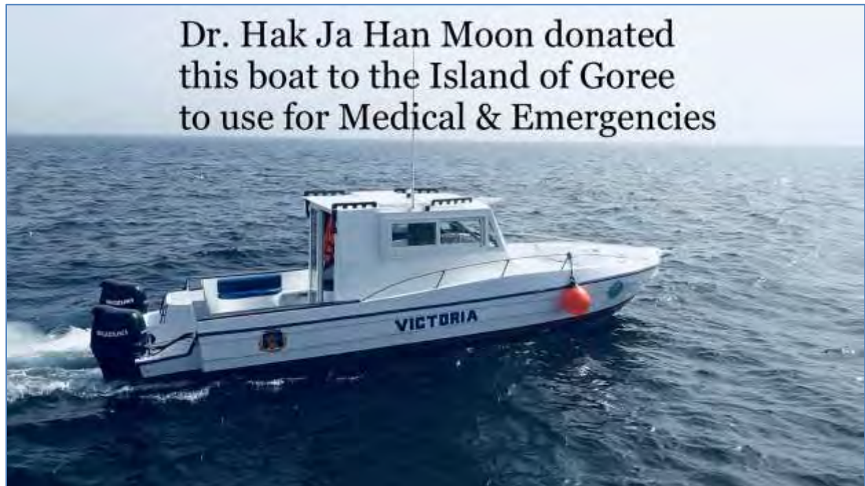
Dr. Hak Ja Han Moon donated this boat to the Island of Goree to use for Medical & Emergencies