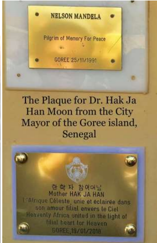
The Plaque for Dr. Hak Ja Han Moon from the City Mayor of the Goree island, Senegal