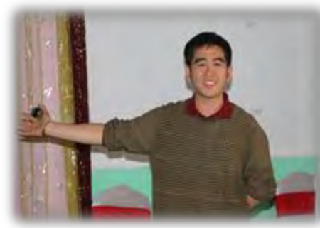
Dream Big by Terumoto Fukuda