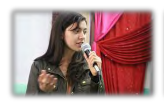
Vertical Tradition by Ami Mowris