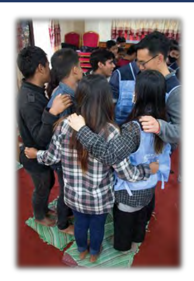
Teamwork activities to practice Core Values