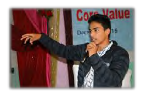
Dream Big by Chandra Crux