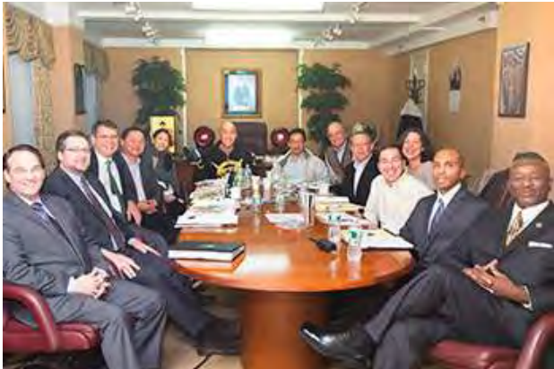
The Property and Facility Management Group, which includes members in Property Management for the New Yorker Hotel, the Learning Center on 43rd Street, and facilities in Washington, D.C.

enlightening. They all did a great job and their presentations were tremendous!"