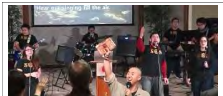
12/27/2015 Sanctuary Service

Followers of the Family Federation put a high priority on believing that "True Parents are One" and that unity is the most important. But unity centered on what? True Father put the highest priority on unity with God's will and perspective, not a horizontal "unity." When we unite with Father's words and will, unity centered on God will naturally come from that.