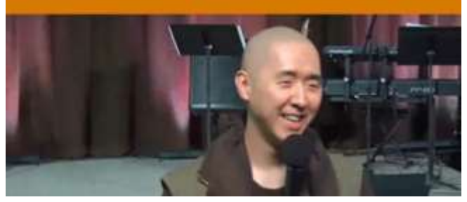
5-8-16 Sanctuary Sermon