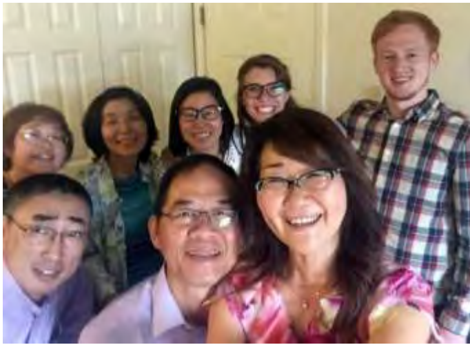
Chicago Sanctuary Service Worshippers