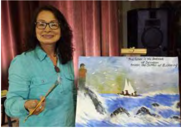
Miho Panzer Praise Painting based on 2016 Motto: "True Father is the Bedrock of Salvation Amidst the Ocean of Suffering"