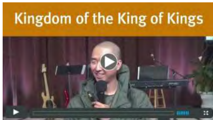
Kingdom of the King of Kings - March 5, 2017 Sanctuary Service

In western culture, we are in a cult of multiculturalism, but there is a big difference between gods who tell you to kill children and God who doesn't. Christianity is not just about repentance from sin. Jesus would be a terrible, egotistical teacher since he often declared himself as the Way, the Truth and the Life as well as the Light of the world. Who likes someone who praises himself? C.S. Lewis said that Jesus was either a liar, a lunatic or the Lord.