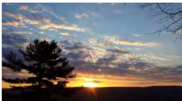
Sunrise at Cheon Il Goong Palace

World Peace and Unification Sanctuary - USA