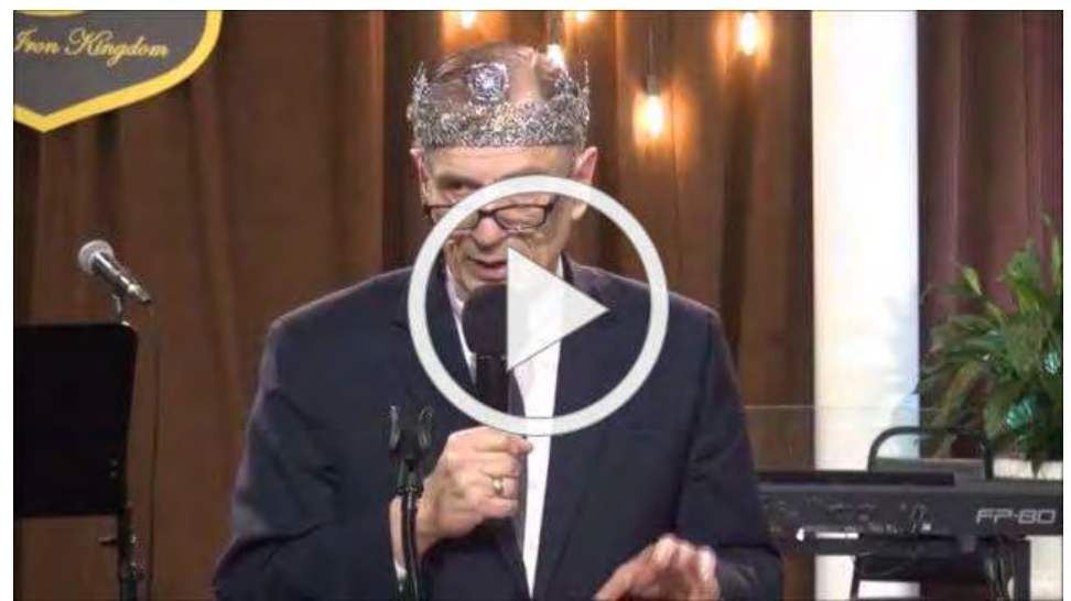
Sunday Service - January 20, 2019 - Unification Sanctuary, Newfoundland PA

and will work to bring them back to fulfill His purpose and gather His lineage.