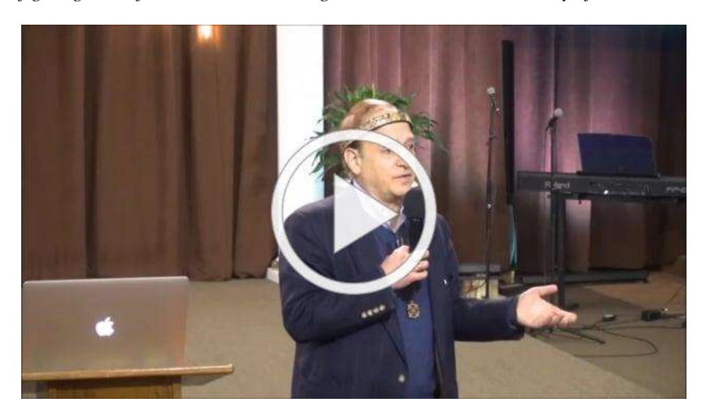
"Biblical View of Violence" Sunday Service - February 3, 2019 - Unification Sanctuary, Newfoundland PA

The communists are a formidable enemy and they dominate two-thirds of the world. Without thinking twice they will execute anyone, anytime. Because many people are afraid of the communists' lack of mercy, they won't say anything against them. But I'm not afraid and I stand up and declare the truth. Even if the United States becomes helpless in dealing with the communists, if the State Department gives up and the CIA loses hope, I will not give up. Even though everyone else retreats, I will spring forward, fighting in the front line and declaring that communism is the enemy of God.