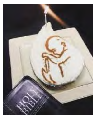
Shingoong's "Tear of God" cake

This is not new or progressive, it is infanticide, which is the oldest of the old. He showed videos of Virginia Governor talking about post-delivery killing of baby. And Governor Cuomo and NY legislators celebrating the passing of the 3rd trimester abortion law.