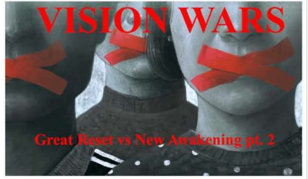
Censorship and Defamation: Weapons of Control

The World Economic Forum and investment management firms like Black Rock, Main Street and Vanguard are using their vast economic power to enforce "woke" anti-fossil-fuels, systemic racism, transgender, biosecurity state agendas aka ESG (Environmental-Social-Governance) on the nations of the world. In the background, leftwing "alchemists" like George Soros implement a dialectical strategy to promote chaos and racial division in America and Europe while ignoring the crimes of the authoritarian/totalitarian nations like Communist China, Iran, etc. which stand to gain from the decline of the U.S. and its allies.