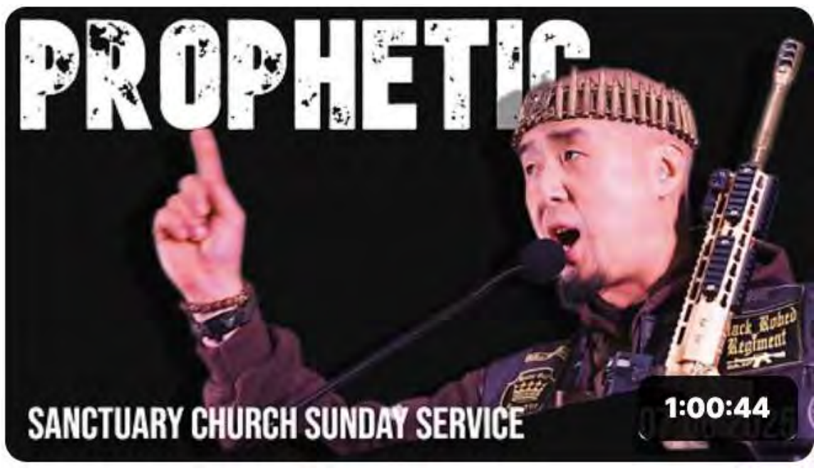
Sanctuary Service 7/6/2025