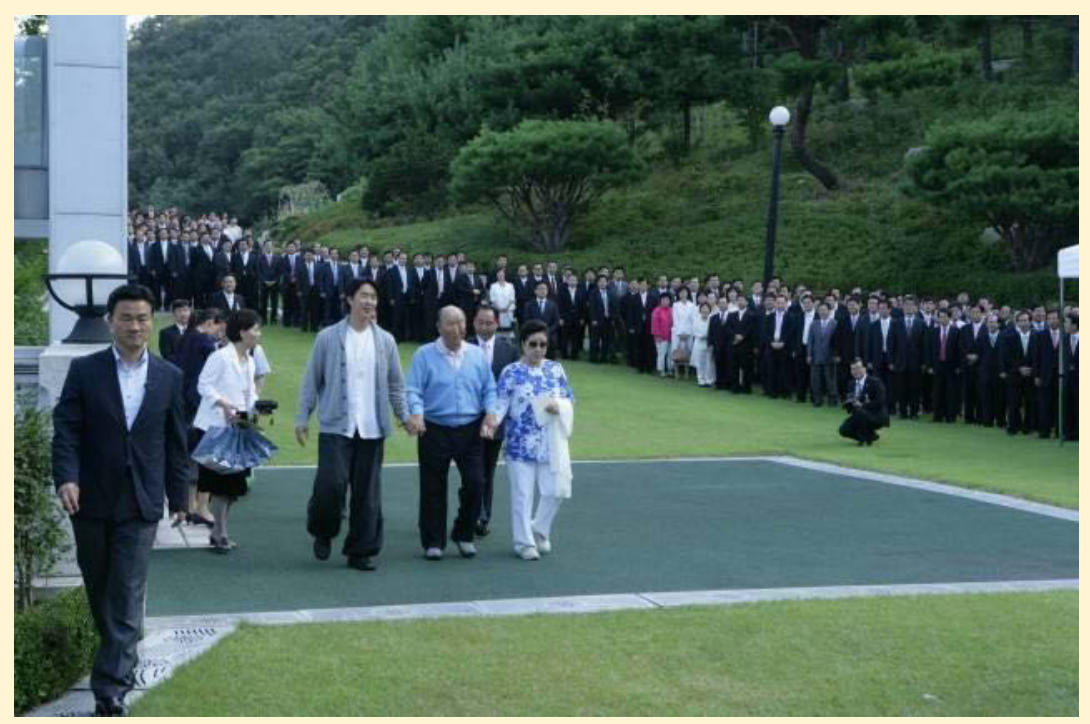
Hoondokhae at Cheon Jeong Gung on 8.6 by the heavenly calendar (September 3)