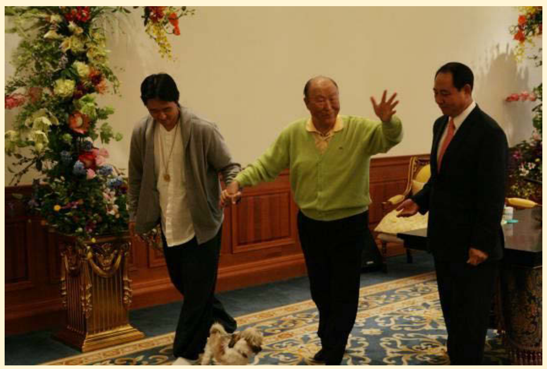
Hoondokhae at Cheon Jeong Gung on 8.8 by the heavenly calendar (September 5)