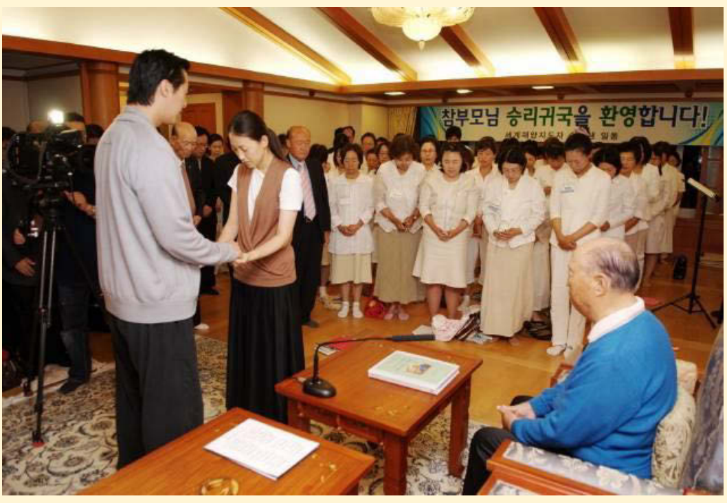
Hoondokhae at Blue Sea Garden (Yeosu) on 8.9 by the heavenly calendar (September 6)