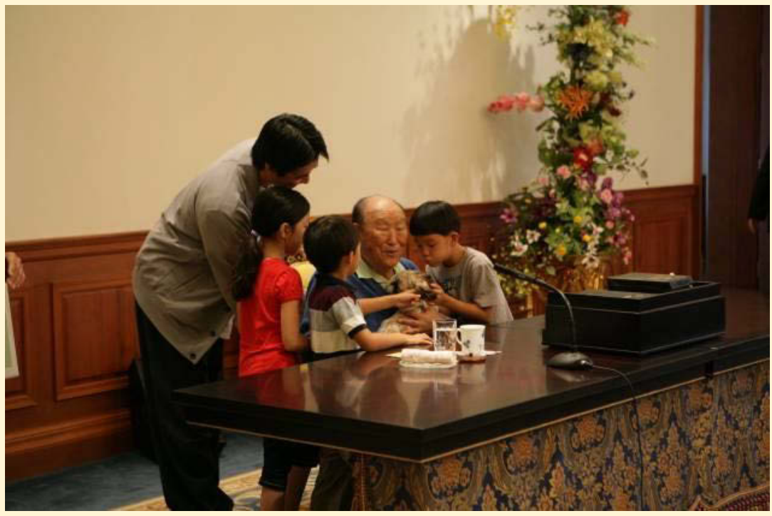
Hoondokhae at Cheon Jeong Gung on 8.7 by the heavenly calendar (September 4)