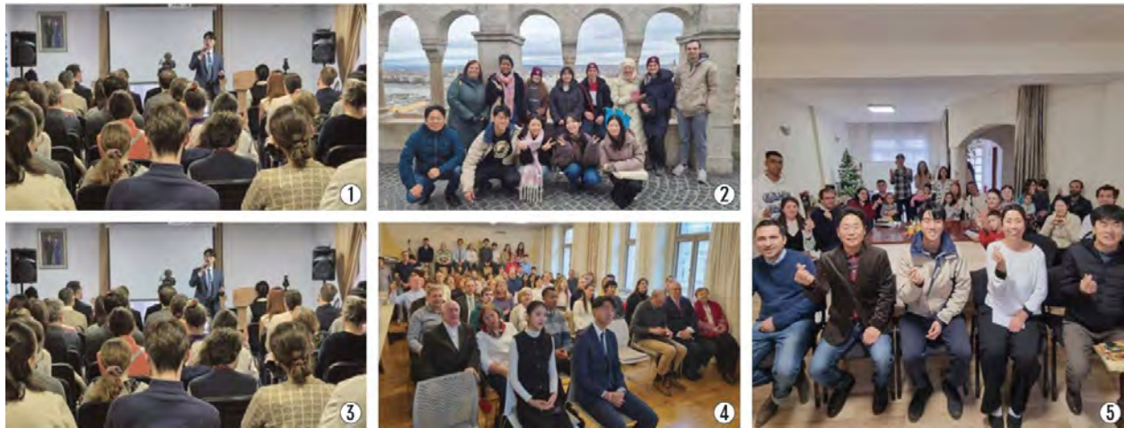
①②Hungary (Future Generation Assembly, Pécs Holy Ground Pilgrimage) ③④Czech Republic (Visit to Marie Zivna's Tomb, Sunday Service) ⑤Romania (Workshop Participation)

The 'Heavenly Top Gun Missionary Shin-chul Moon and Spouse European Tour' was conducted for 50 days from December 9 to January 27. The tour was planned to testify about True Mother centered on True Parents' teachings, unite with Europe's future generation, and assess key mission fields.