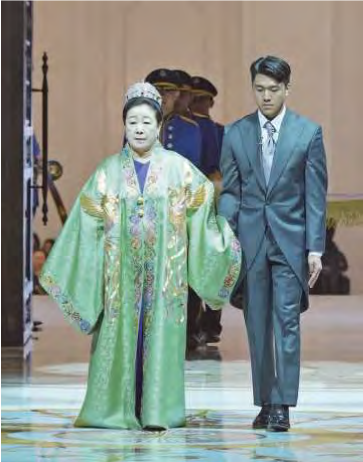
Procession Before the Entrance Ceremony

The Cheon Won Gung Cheonil Sanctum Entrance Ceremony was held magnificently on April 13 with approximately 50,000 participants gathered at Cheon Won Gung and the Cheongshim Peace World Center, including leaders from political, economic, religious, and cultural fields worldwide, as well as blessed families and members of the Family Federation. The event reached 194 countries through a live worldwide broadcast.