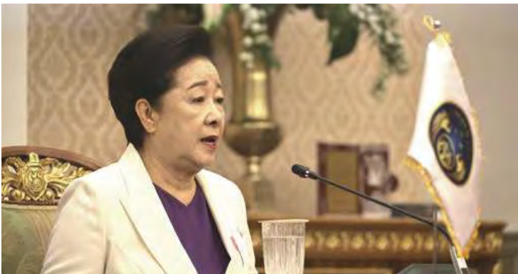
True Mother at the Reception for Inter-Parliamentary Speakers' Conference (ISC) Chairpersons (at Cheon Won Gung)