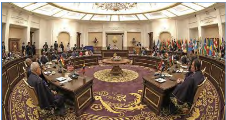
True Mother at the Reception for Inter-Parliamentary Speakers' Conference (ISC) Chairpersons (at Cheon Won Gung)

The choir filled the venue with beautiful melodies of "Song of Settlement," "The Queen of the Universe Will Be Born," "Protecting the Young Daughter," and "The Course of True Parents." The dance troupe symbolically expressed Heavenly Parent's providence of creating heaven and earth and preparing for the birth of True Mother, the Only Begotten Daughter, through the Korean people; the manifestation of True Parents for humanity through True Parents' Holy Wedding; the 6,000-year providential course of the victorious True Parents settling on earth; and the victory of Holy Mother Han, True Mother, who fulfilled that dream.