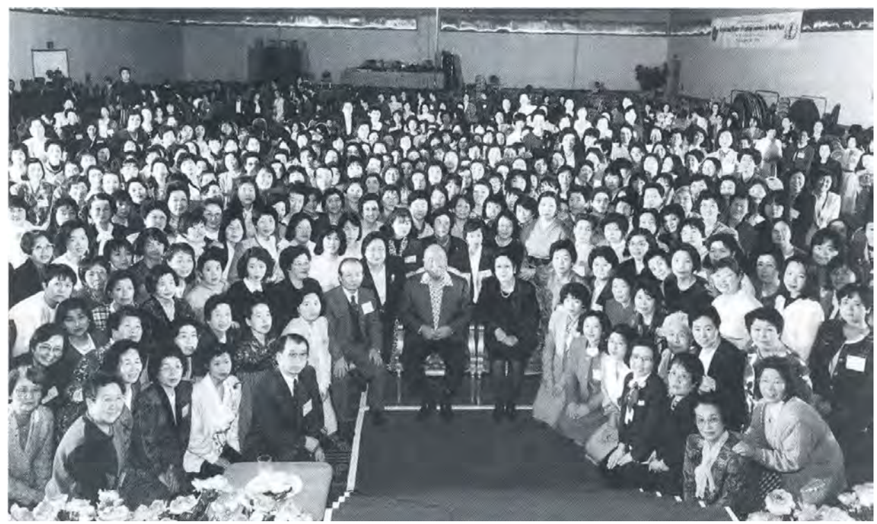
True Parents (seated center) pose with the Japanese women during an International Women's Friendship Conference for World Peace in Washington, D.C.

Why does God's providence of restoration take such an incredibly long time? Because the elder son always persecutes and tries to assassinate the younger son. Finally, he is conscience- stricken; then he apologizes and gives everything to the younger brother.