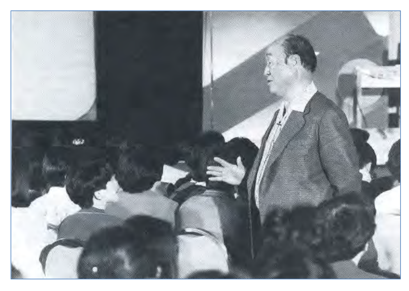
Leaders' Conference Instructions

Pride and arrogance destroys everything. I was in the lowest position, but I always make bigger and bigger plans. I am just in a servant position. We must go over the satanic world. You need to know that the formula for restoration starts with the family. Re-creation follows the same formula.