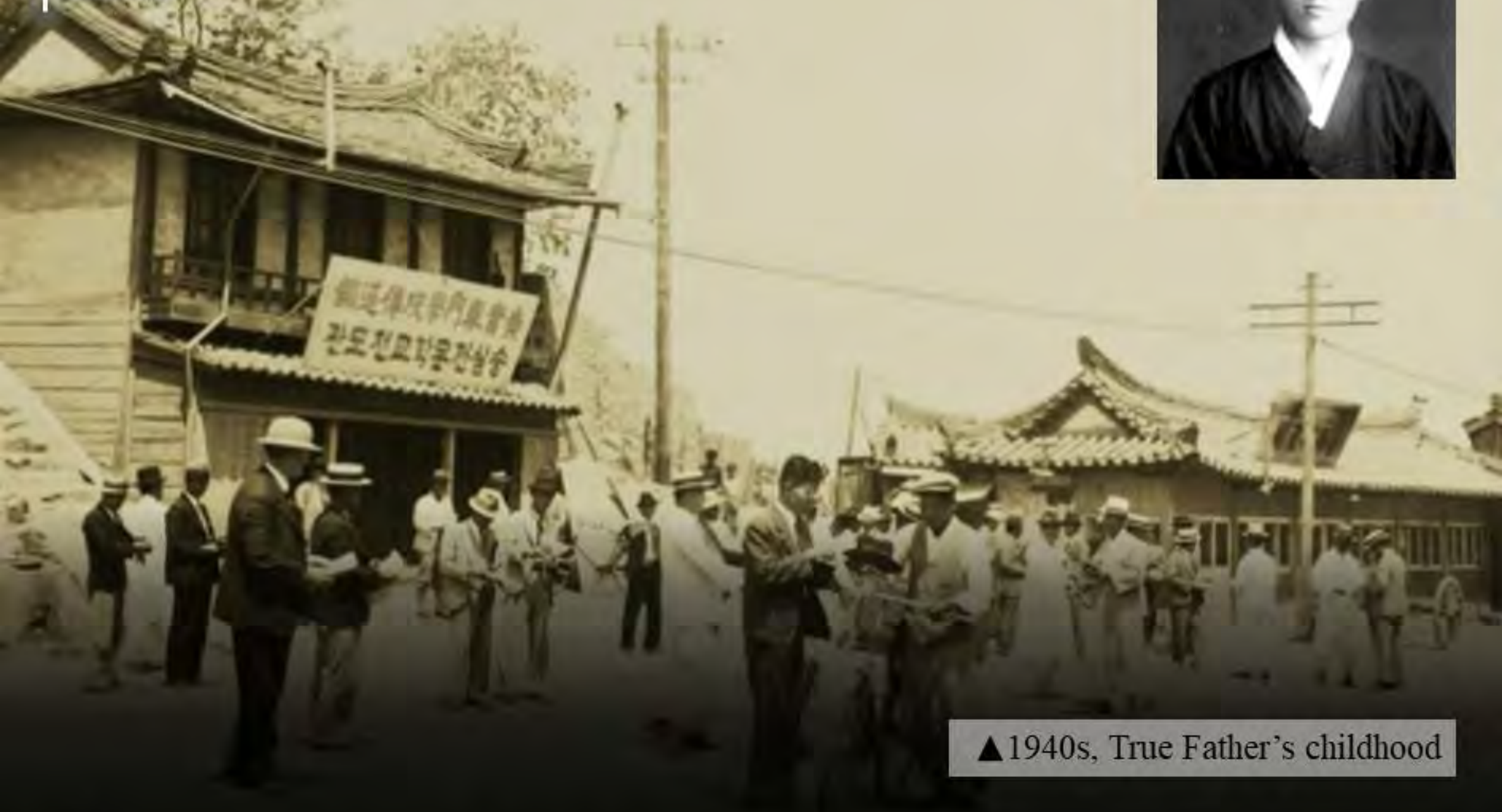
▲ 1940s, True Father's childhood

In 1946, True Father received the mission from God to go to North Korea where presents the East Jerusalem and disseminates the word to Pyongyang, Christian city.