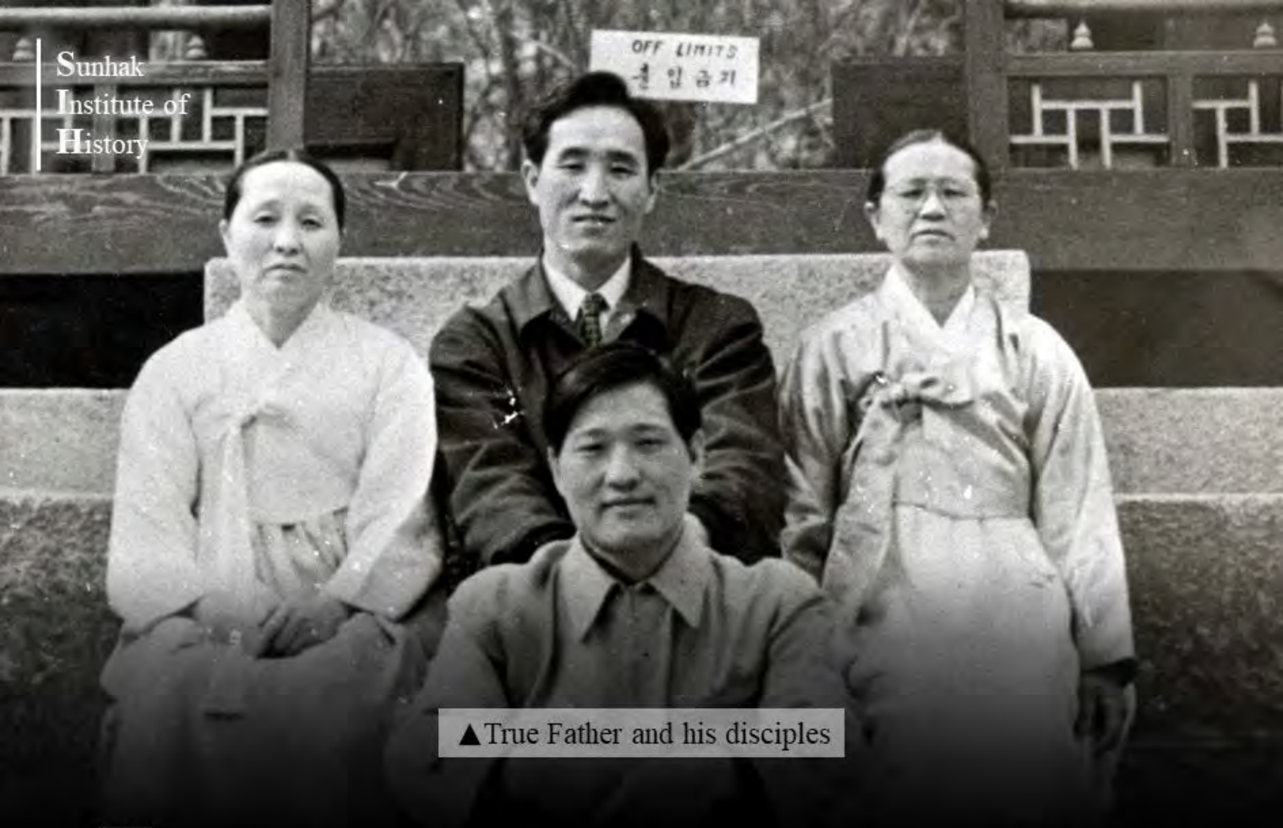
▲ True Father and his disciples

T rue Father set the foundation to start again the True Father's Public course by completing all courses and he left the Heungnam Prison on October 14, 1950.