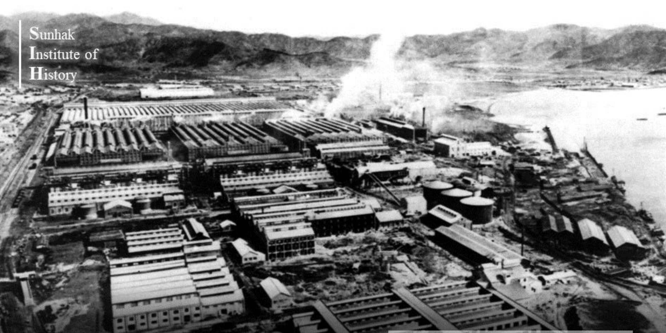
▲ The fertilizer factory in Heungnam

After all, True Father was arrested on suspicion of Syngman Rhee's spy and take to the Daedong Detention Center in Pyongyang on August 11, 1946. After releasing the Daedong Detention Center on innocence, True Father was sent to Heungnam Prison again on February 22, 1948 after 15 months.