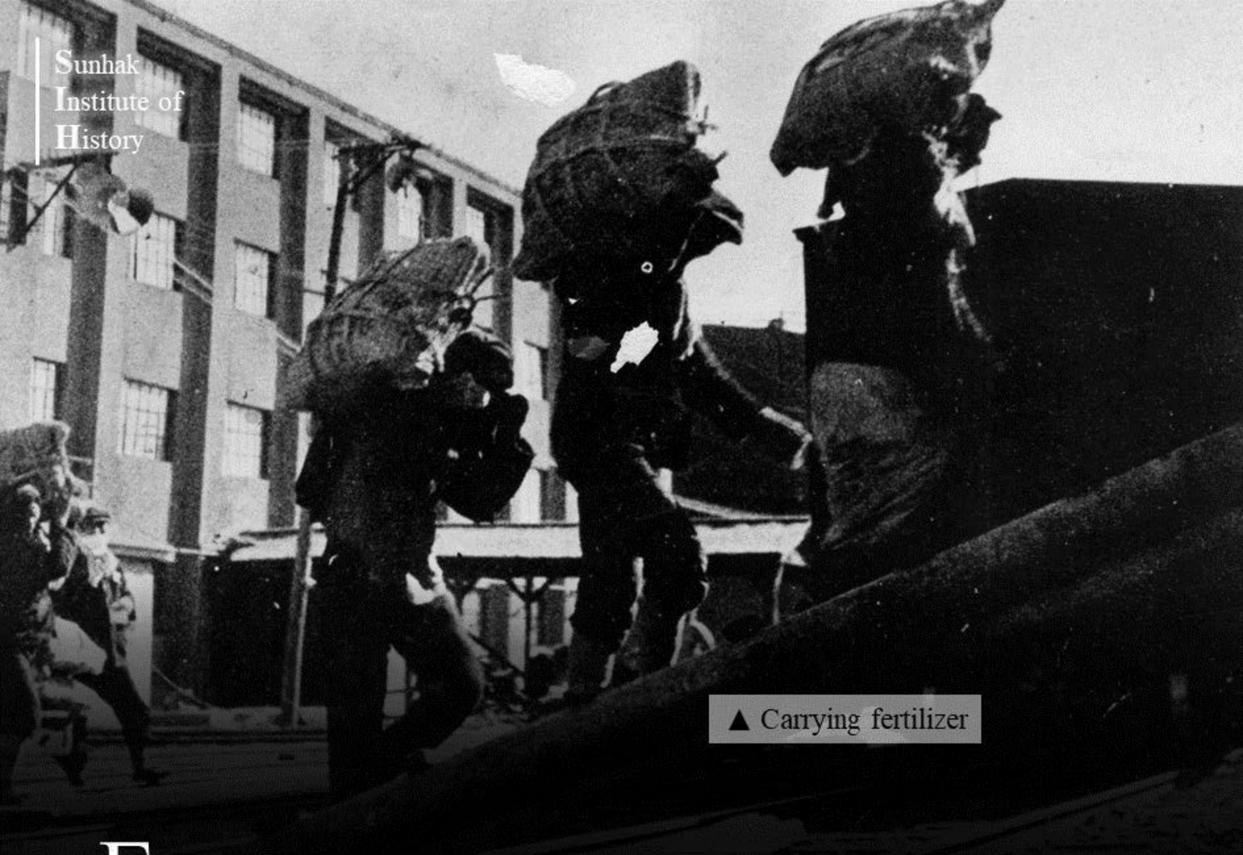
▲ Carrying fertilizer

Even though True Father suffered torture, he prayed for God “It is not the time for rest. I still have the mission and I promise to fulfill this mission for you.”