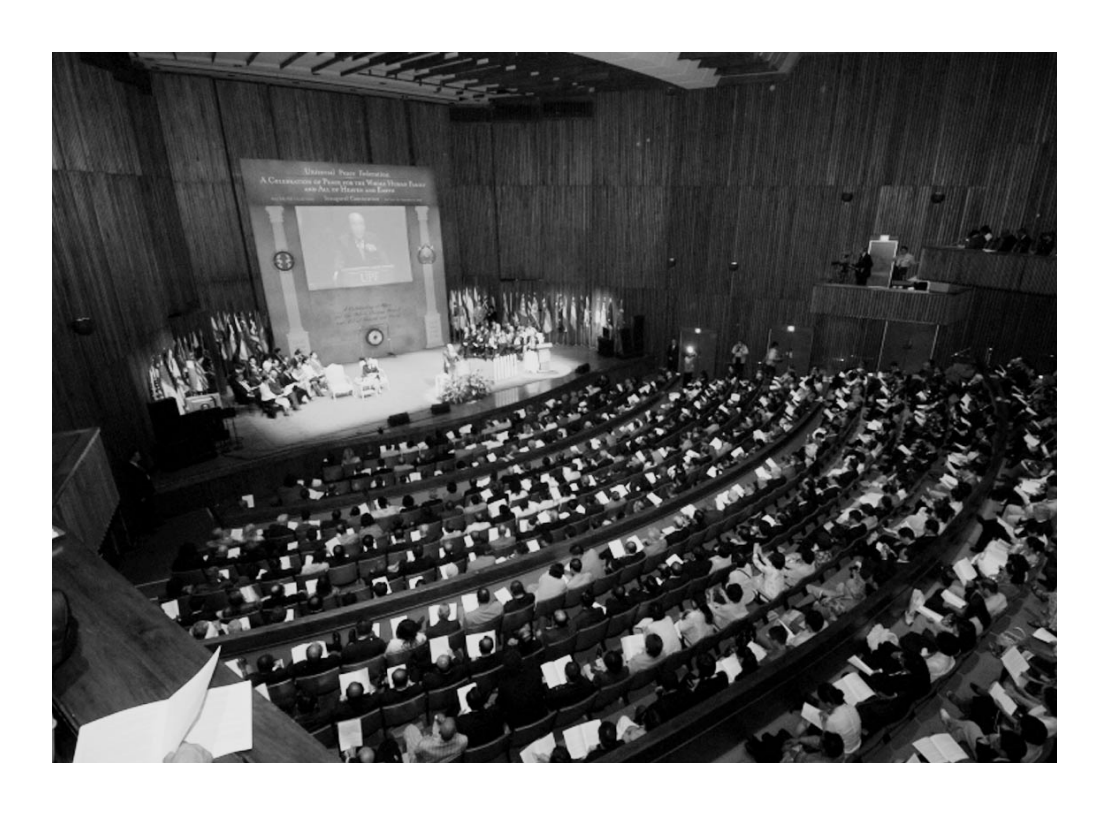
The Founding of the Universal Peace Federation at Lincoln Center, New York City, September 12, 2005