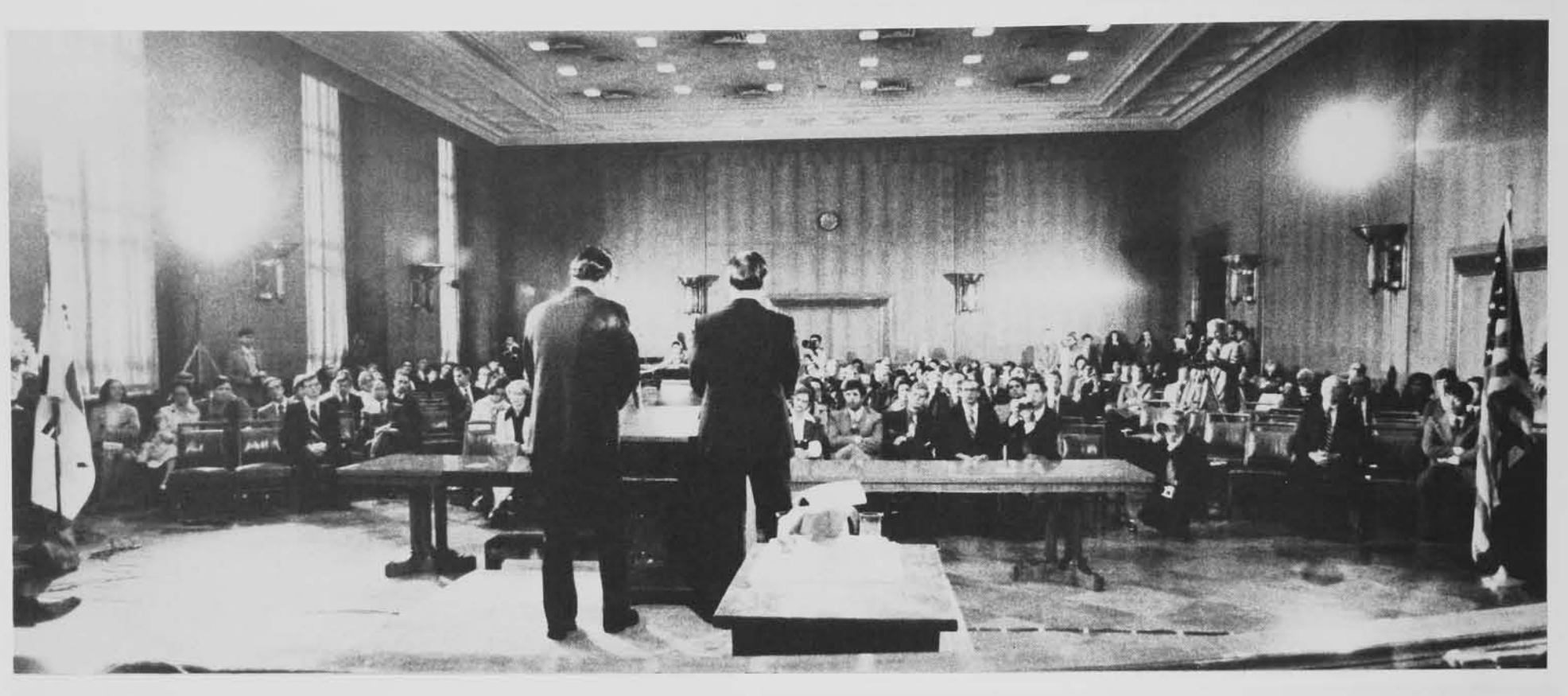
'Sermon on the Hill'