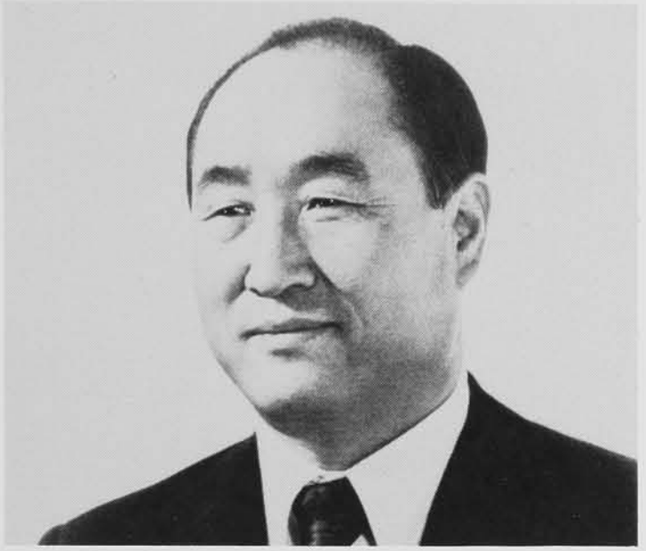
The Reverend Sun Myung Moon