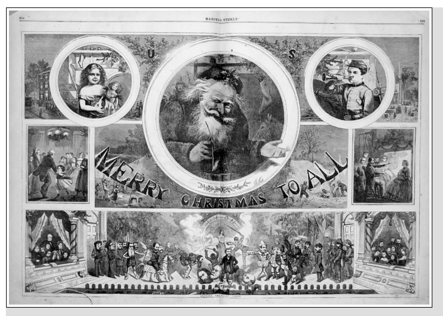
Image: This Nast centerfold depicts the various ways Christmas was being celebrated after the Civil War.

The growing American public school system in the 1880s and 1890s mobilized Santa and Christmas as a quasi-national holiday. Stu-dents were required to decorate the school Christmas tree, participate in pageants, bring gifts to exchange, and as homework describe their family celebrations. The celebration of Christmas, like speaking English, voting, and hard work, had become a test of assimilation, Americanization, and loyalty to their new nation for the millions of Italians and Eastern European Catholics, Orthodox and Jews who flowed through Ellis Island. [19]