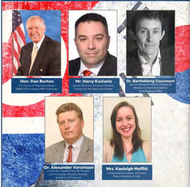
Hon. Dan Burton U.S. House of Representatives (1983-2013), Global IAPP Chairman