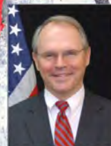
Amb. Christopher Hill Former Head of the U.S. Delegation to the Six Party Talks