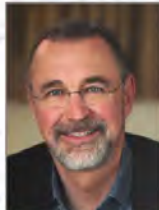
Hon. Matt Salmon U.S. House of Representatives (1996-2007)