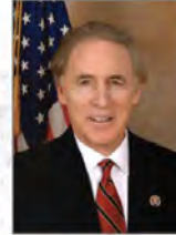
Hon. Cliff Stearns U.S. House of Representatives (1989-2013)