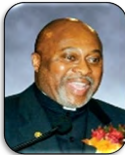
Patriarch George A. Stallings, Jr Imani Temple African American Catholic Congregation Chair, IAPD - USA