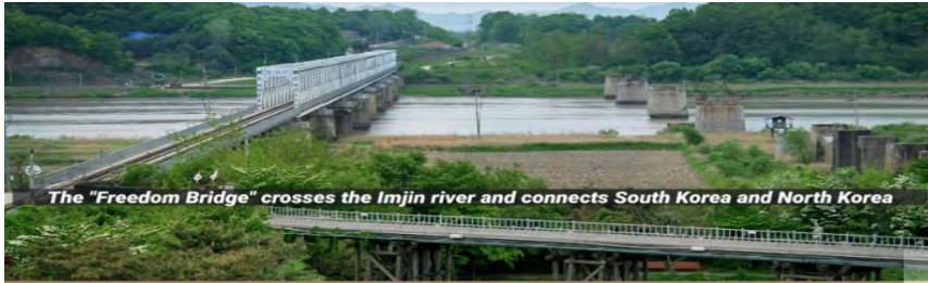
The "Freedom Bridge" crosses the Imjin river and connects South Korea and North Korea

Tuesday, May 14, 2024 2 - 3:00 PM (EST) 3 - 4 AM (May 15, Korea)