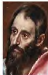
Saint Paul (ca. 10-67 AD), one of the apostles of the early church and author of several letters in the New Testament. From painting by El Greco, from Saint Louis Art Museum, Missouri, USA.

"So I find this law at work: although I want to do good, evil is right there with me. For in my inner being I delight in God's law; but I see another law at work in me, waging war against the law of my mind and making me a prisoner of the law of sin at work within me. What a wretched man I am! Who will rescue me from this body that is subject to death?" (NIV)