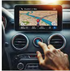
Guided by GPS.

So, when I watch the news every morning, I feel like I'm living amidst various problems, like