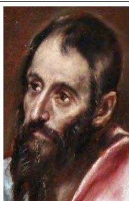
Saint Paul (ca. 10-67 AD), one of the apostles of the early church and author of several letters in the New Testament

"I want you to be free from anxieties. The unmarried man is anxious about the affairs of the Lord, how to please the Lord, but the married man is anxious about worldly affairs, how to please his wife, and his interests are divided." (RSV)