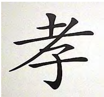
The Chinese character for hyo (filial piety). In the character a son, 子 (Korean ja ), carries an old man, 老 (Korean no ), on his back

Third, the "Epic of the Koreans as a Chosen People" visually expresses to humanity the history of Heaven's chosen people through culture and arts, such as paintings. It conveys the spirit and life of the Korean people centered on Heaven.