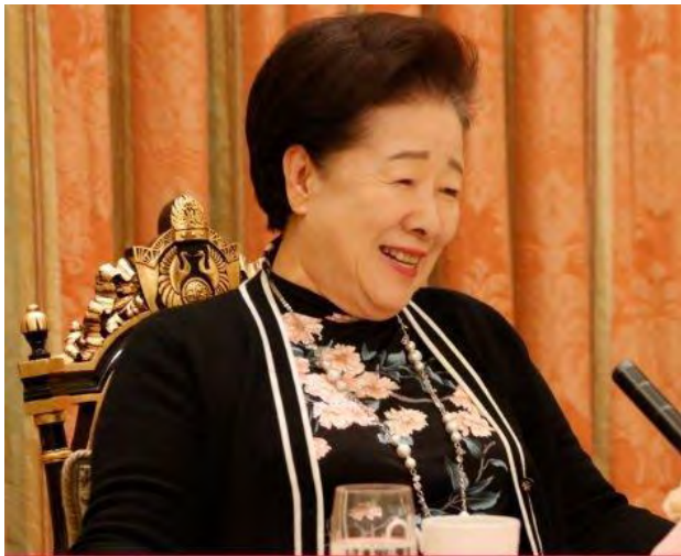
Mother Moon in 2024

First, the "Epic of the Koreans as a Chosen People" contains secrets hidden in the "6,000 years" of history. True Mother has revealed this because the time has come. It includes previously undisclosed truths about the essence of our Heavenly Parent, the hidden truth of Korea's Christian missionary history, the preparation process for the emergence of the Only-begotten daughter , and more.