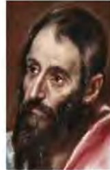
Saint Paul (ca. 10-67 AD), one of the apostles of the early church and author of several letters in the New Testament. From painting by El Greco, from Saint Louis Art Museum, Missouri, USA.

"I want you to be free from anxieties. The unmarried man is anxious about the affairs of the Lord, how to please the Lord, but the married man is anxious about worldly affairs, how to please his wife, and his interests are divided." (RSV)