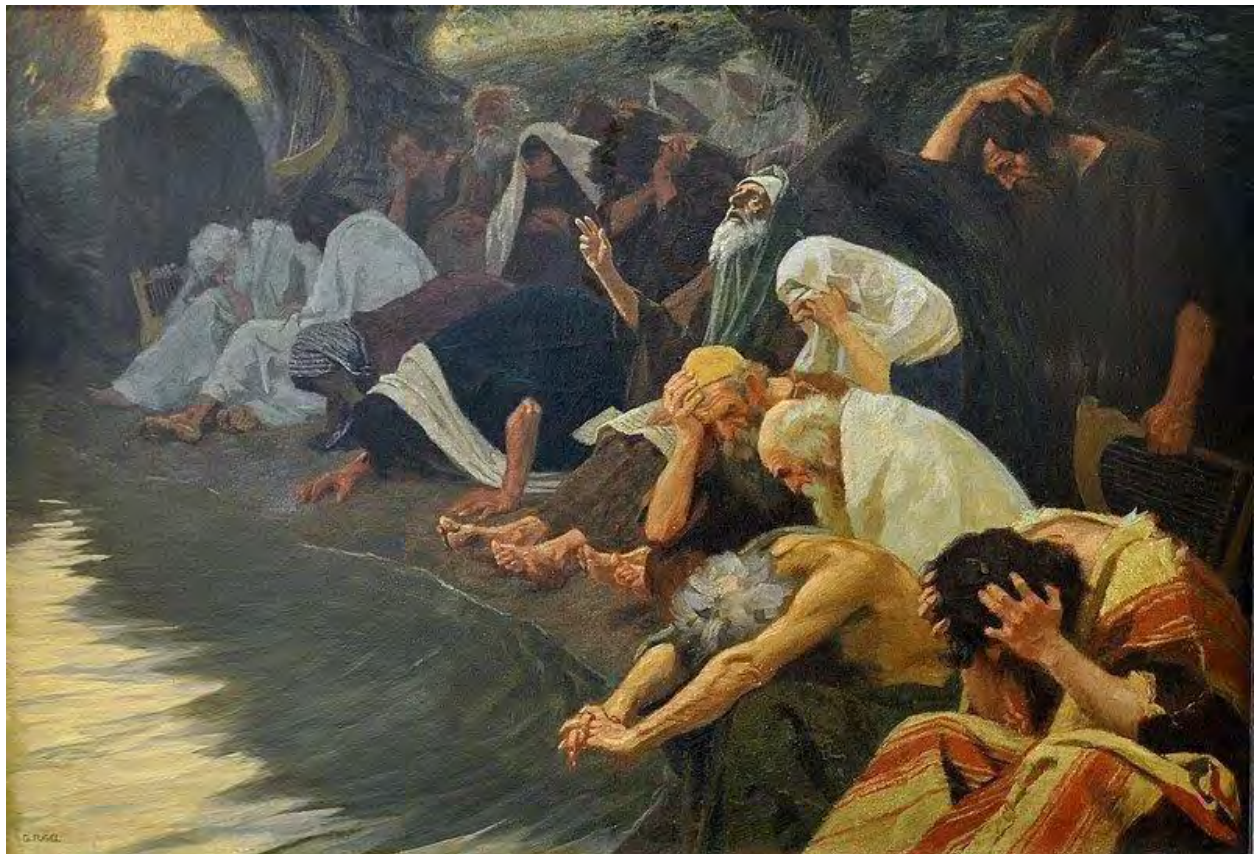
By the Waters of Babylon, Photo (2014) of painting by Gebhard Fugel

Extracts from a speech given by Yong-cheon Song, International President of the Family Federation for World Peace and Unification , at a prayer meeting for leaders and members in Gapyeong, South Korea 11th October 2024. Translated from Korean.