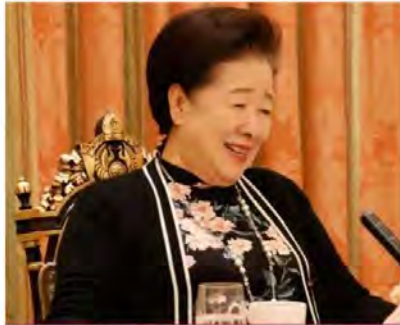
Mother Moon in 2024.

Through these words, he emphasized that remaining unmarried could be spiritually more beneficial. However, if Paul had considered not only the life of Jesus, but also his role, mission, and vision – if Paul had looked not only at Jesus but also at what Jesus had been facing – Paul's thoughts and conclusions might have been different.