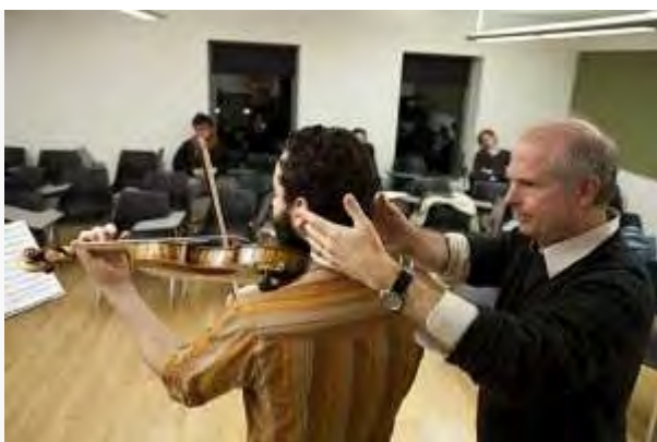
Correcting violin posture

That's not easy, because firstly I have to admit that the way I've been doing something might be wrong. I might feel justified in ignoring the truth and defy reason, sticking to old ways. Or I might (inappropriately) infer that I (as a whole person) am wrong and devalue myself. I might allow the old habit define me, especially if it's a bad habit. Rather than changing my ways I could give into an identity which is characterised by the old habit. There's a laziness about both approaches, which declines the opportunity to engage with the habit and address it.