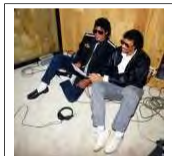
Try studying God’s word a little more closely next time

As God has shown us, by turning stone to bread So we all must lend a helping hand.