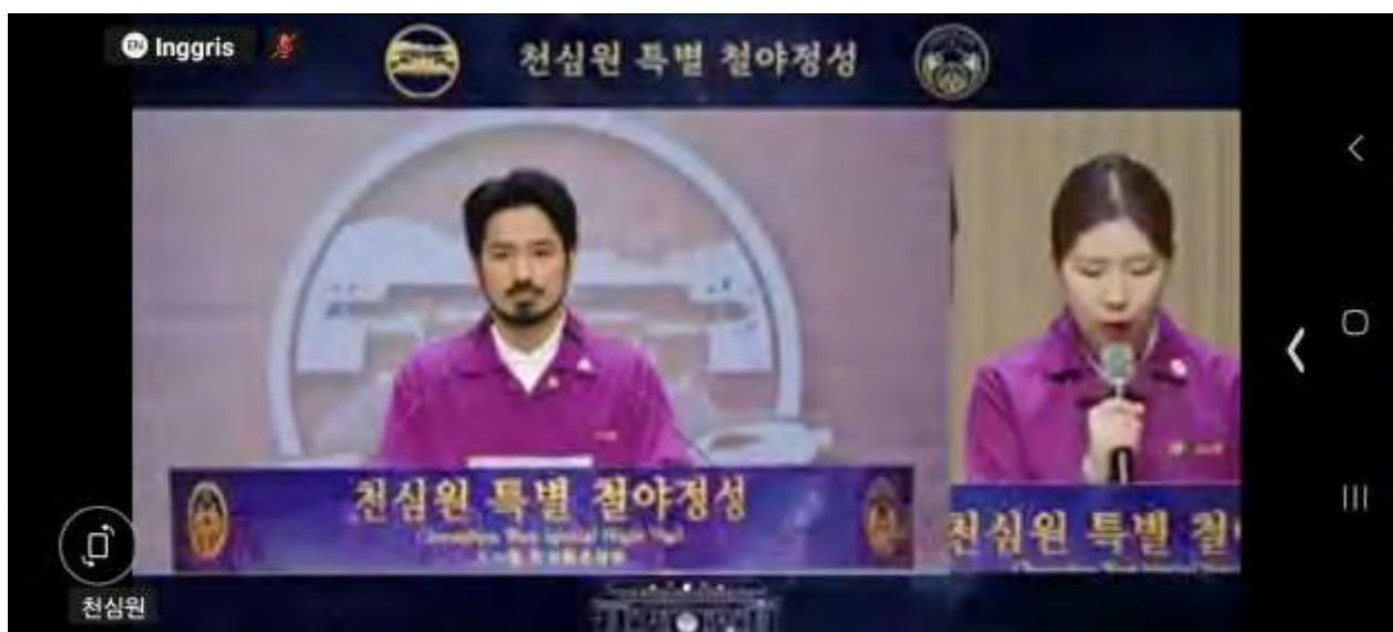
photo of Moses receiving Commandment from God...and asked members to write a motto that could last forever for them... one motto was 'attendance' centering on H Heart... 'Through devotion let me find H Heart and attend Heavenly Parent eternally' and the staff gave so much and then afterward they offered help to staff...

A week before they offered three times per trainee so that we can and H can guide them well..