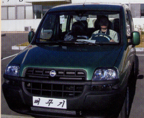
The Beokkuki model, assembled by Pyonghwa Motors