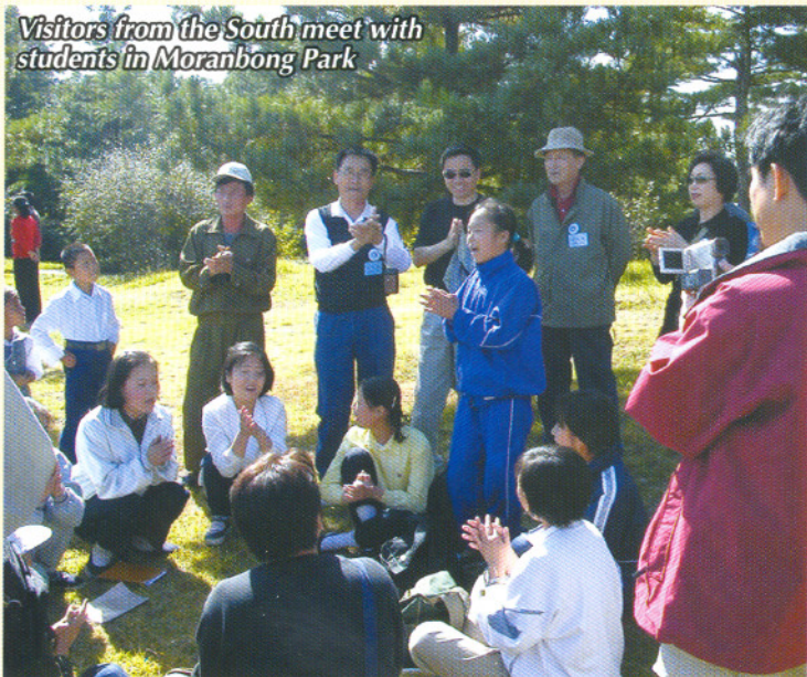
Visitors from the South meet with students in Moranbong Park

In Chungju we visited the birthplace of Rev. Sun Myung Moon, whose efforts lay behind the success of these tours. 6 People in the North say that Rev. Moon is doing a great deal to encourage the reunification of the Korean Peninsula. The Chungju part of the tour was canceled from the third tour group's itinerary due to the work to pave the road, which is expected to be completed by the end of the year. The itinerary was altered to include a visit to Tangun-