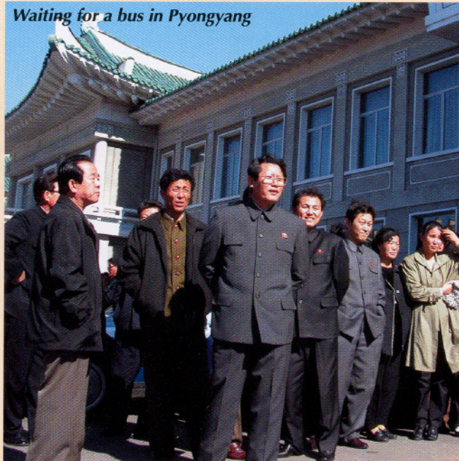
Waiting for a bus in Pyongyang

After dinner, the tourist party enjoyed the evening at standing bars, karaoke bars and billiard halls. At a standing bar, the guide and the tourists conversed freely. They spoke openly about topics such as the outbreak of the Korean War, the Hyo-soon and Mi-soon incident 11 , North-South unification, and various sensitive issues closely tied to