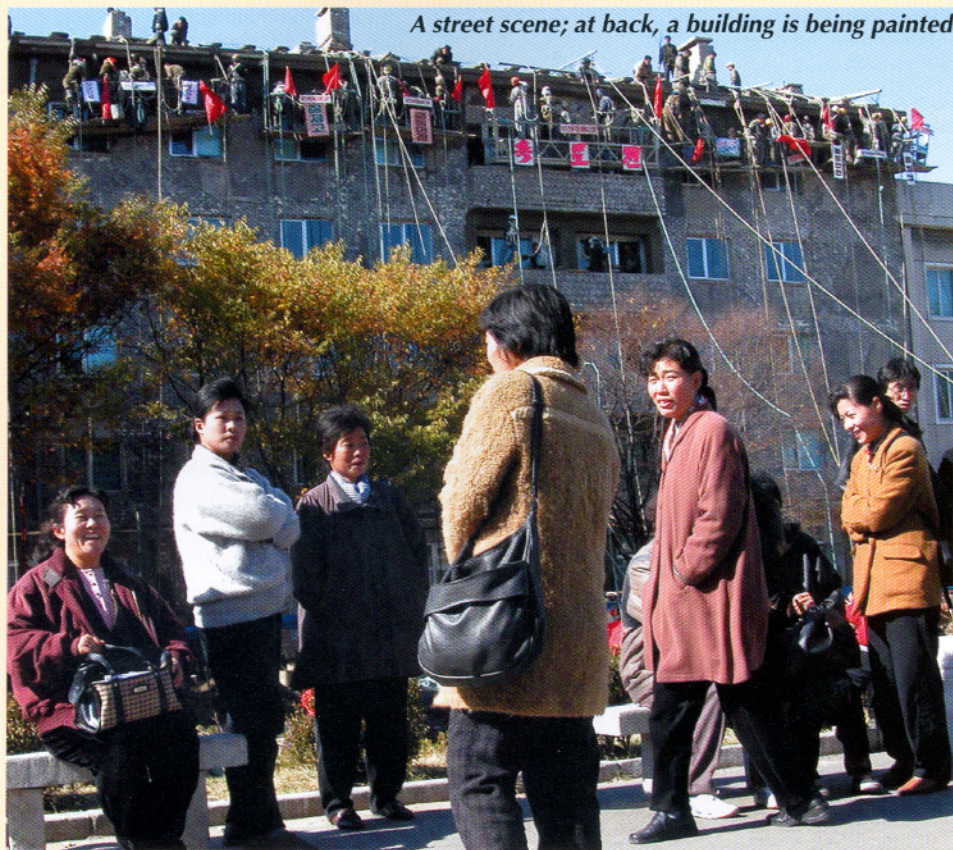
A street scene; at back, a building is being painted

where he or she stands. This Pyongyang tour is not an ordinary tour. Despite the difference in theory, unification starts from a connection with people who have the same blood. The stronger our wish to reunite, and the more we put reconciliation into action, the closer North and South will come together. Likewise, the deeper their capacity to interact becomes, the greater the number of tour sites we can have access to, and the more often South-erners meet Northerners, the quicker the day of unity will come.