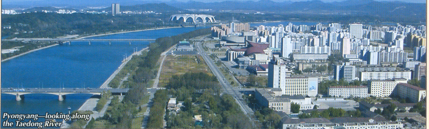
Pyongyang—looking along the Taedong River

For several weeks beginning in September, groups of South Korean tourists traveled to North Korea for five-day visits. This was a milestone in that these were the first South Koreans to visit Pyongyang purely for the purpose of tourism. For many—especially those whose homeland is the northern half of the peninsula—this was not an ordinary vacation. And as the tours were the fruit of True Parents' movement for unification, they were consecrated to an important role in advancing the cause of peace.