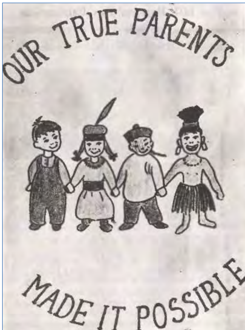
Parents' Day Card sent by Norwegian Family

After taking Korean rice-cake as a Korean-style instant lunch, the members enjoyed a Principle Lecture contest and a VOC lecture contest sponsored by the Main Office.