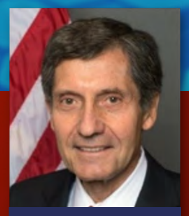
Ambassador Ioseph DeTrani

General U.S. Army (Ret); Commander UNC/CFC/USFK, Korea (2008-11)