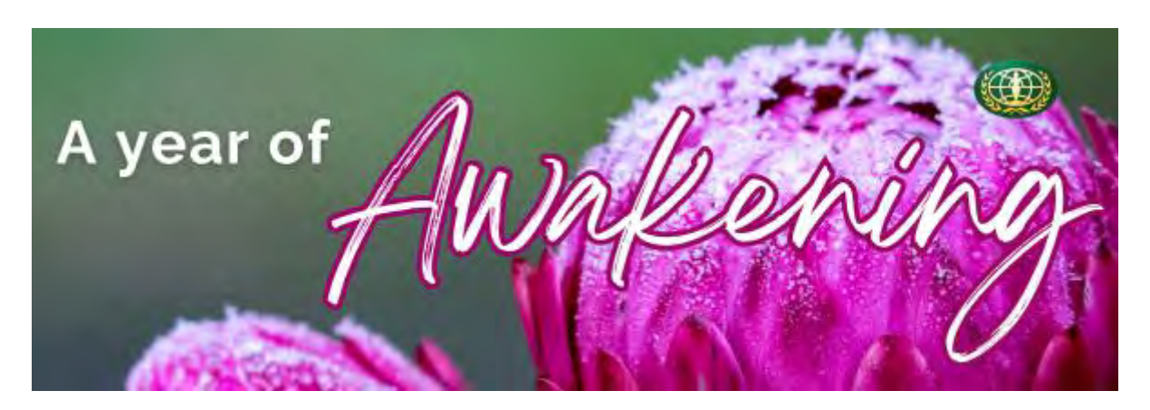
With your support, we launched 25 new HerTribes: safe spaces where women gather, thrive, and transform together!