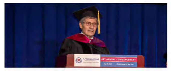
JUNE 04, 2024