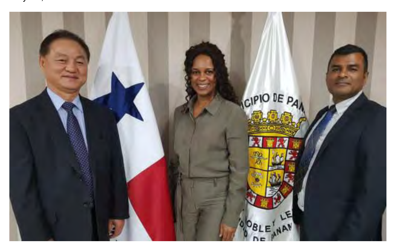
Mexico City, Mexico -- In April and May, representatives of UPF-Central America and the Caribbean met with government leaders in Mexico, Honduras, Costa Rica and Panama to discuss UPF's work and invite them to the Latin America Summit, which will be held from August 2 to 5, 2018 in Sao Paulo, Brazil.