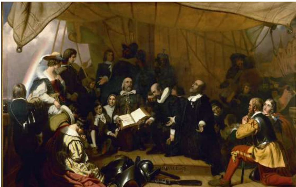
The Embarkation of the Pilgrims, a painting on the interior of the Capitol Rotunda