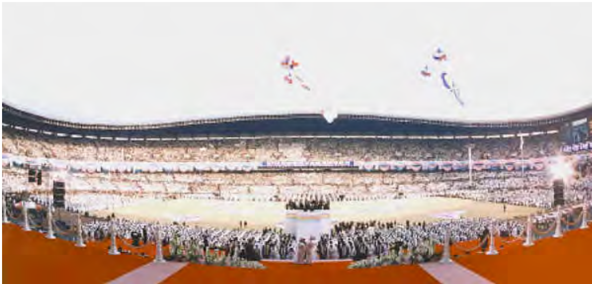
The Blessing of 360 Million Couples on February 7, 1999, Seoul, Korea