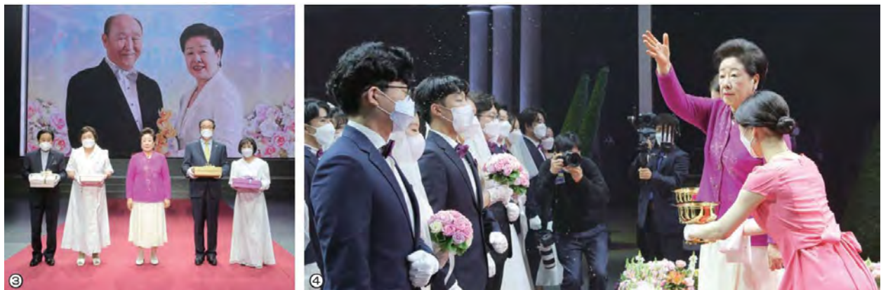
3. Christian pastor couples giving gifts to express gratitude for receiving the Blessing

Without a doubt, they will unwaveringly charge forward toward the completion of Cheon Il Guk -- one family of humankind under Heavenly Parent -- which is Heavenly Parent's dream and the desire of all people. Therefore, True Parents offer their gratitude and glory to Heaven, and believing that these couples will fulfill their responsibilities. I proclaim and bless this all in True Parents' names. Aju.