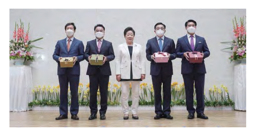
Unity with True Parents is essential

Who proclaimed Cheon II Guk? Now that we have proclaimed Cheon II Guk, we must create the environment in which we can live in attendance to our Heavenly Parent. For sixty years, we invested much effort. Can you therefore imagine the heart I felt when I stepped up, pledging in front of God to restore the environment for Cheon II Guk within seven years?