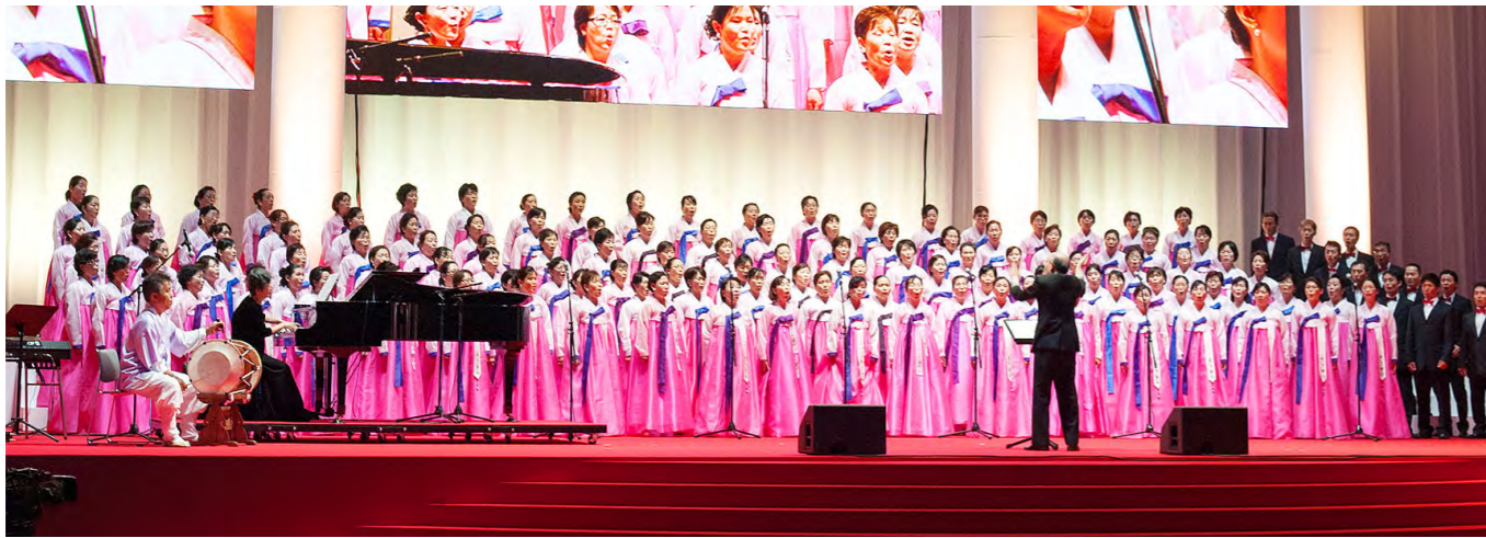
Shin-Tenchi Chorus, comprising Korean and Japanese women