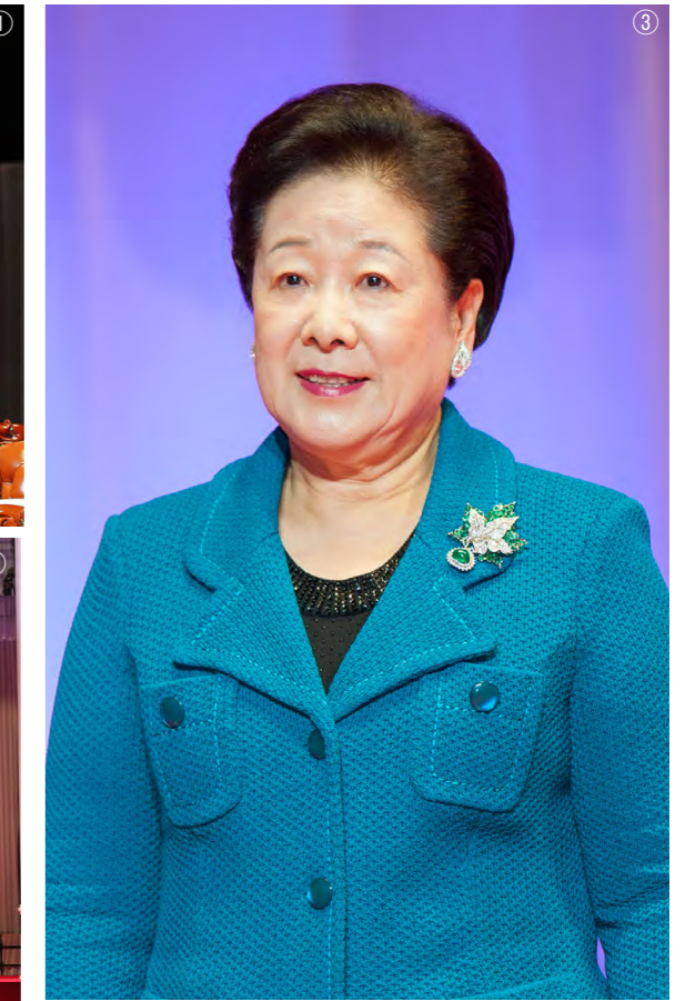
① Bouquets of gratitude presented by second generation ②③ True Mother speaks words of truth