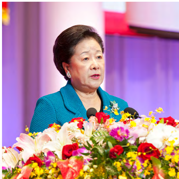
True Mother gives words of truth

On October 16, 2013, after Typhoon Wipha left the skies of Saitama prefecture, where the Commemorative Rally of the 55th Anniversary of the Unification Church Mission in Japan and 54th Anniversary of the Church Founding was to be