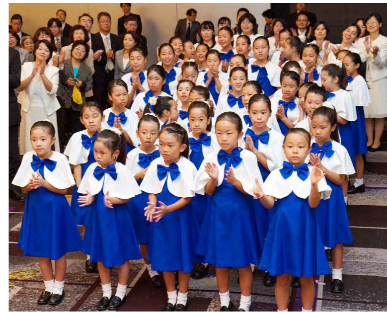
Sunhak Choir offers a song