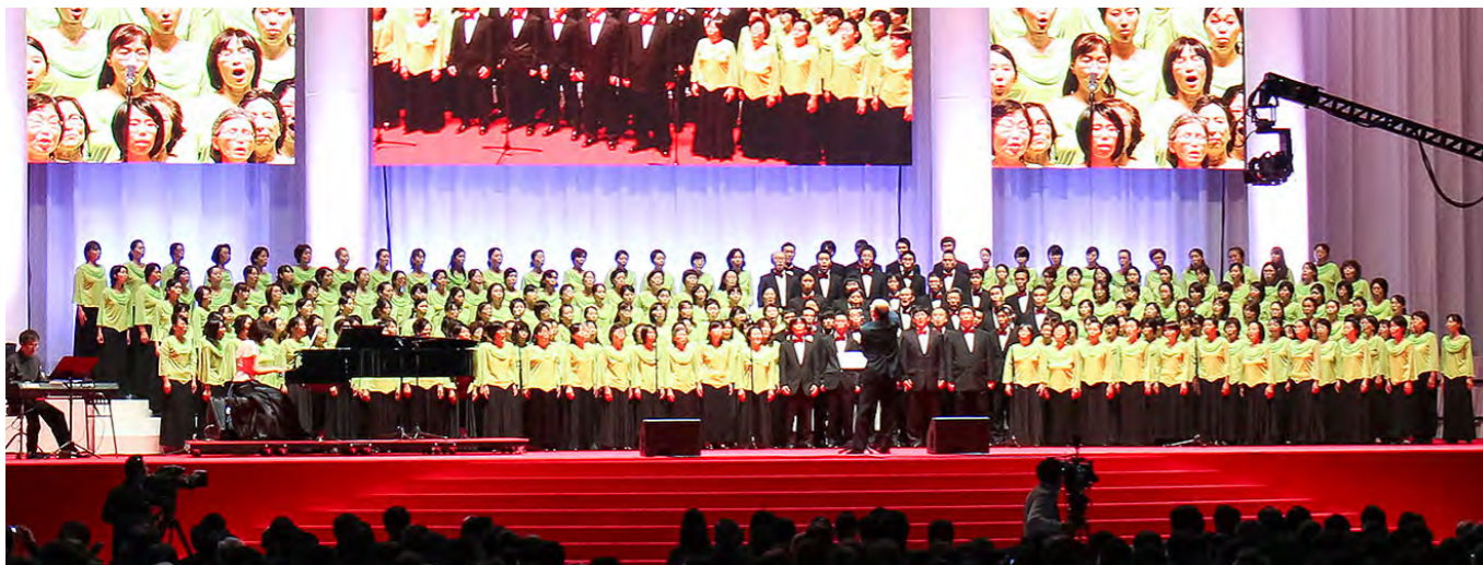
Joint Choir comprising the young and old