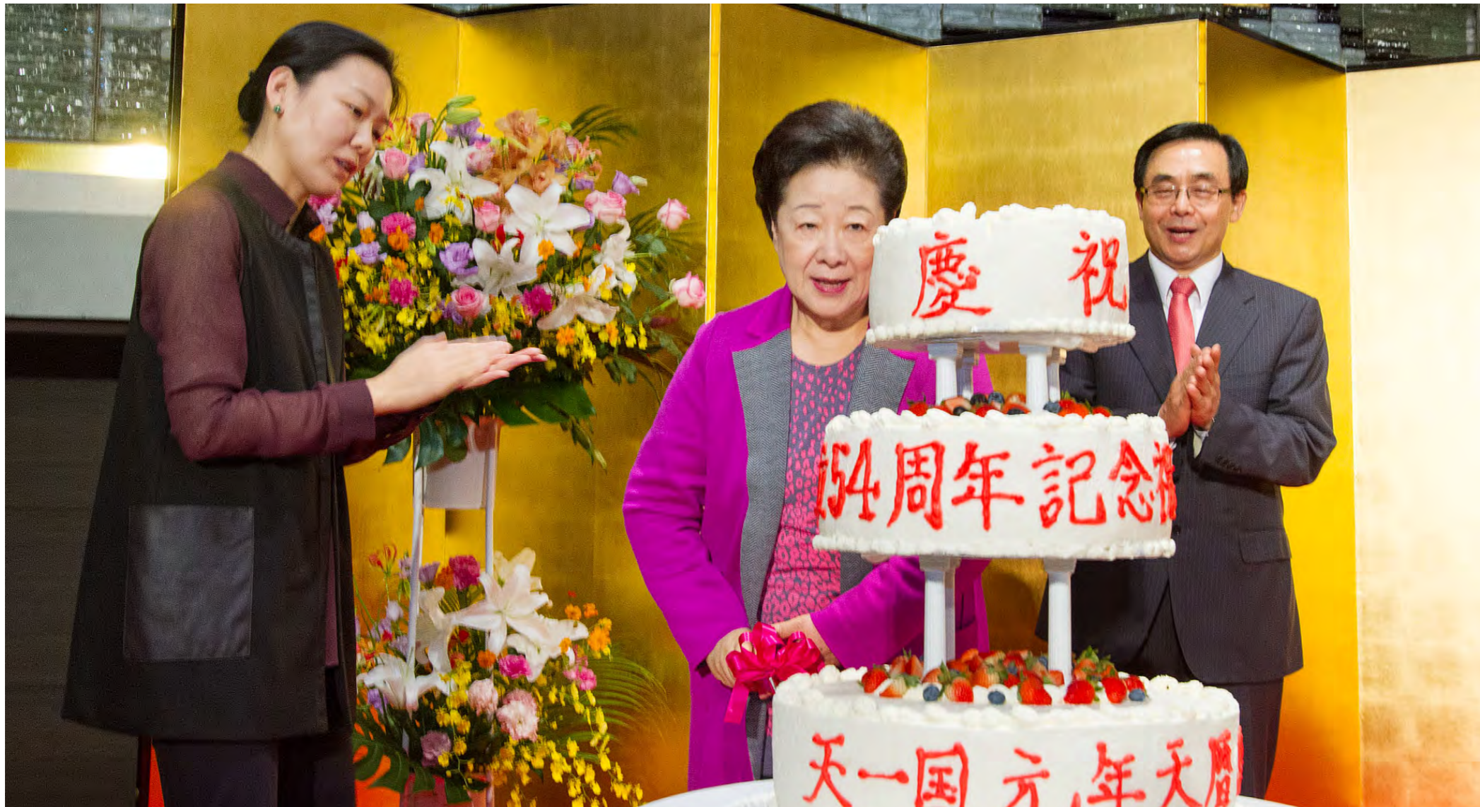
True Mother cuts the victory cake

On September 13th of the first year of CIG by the heavenly calendar (October 17th, Thursday by the solar calendar), from 6:00 a.m., approximately 500 leaders, Blessed Families and members gathered for a Victory Celebration Hoondokhae session for the Commemorative Event of the 55th Anniversary of the Unification Church Ministry in Japan and 54th Anniversary of the Church Founding held the previous day with 20,000 attending at the Saitama Super Arena.