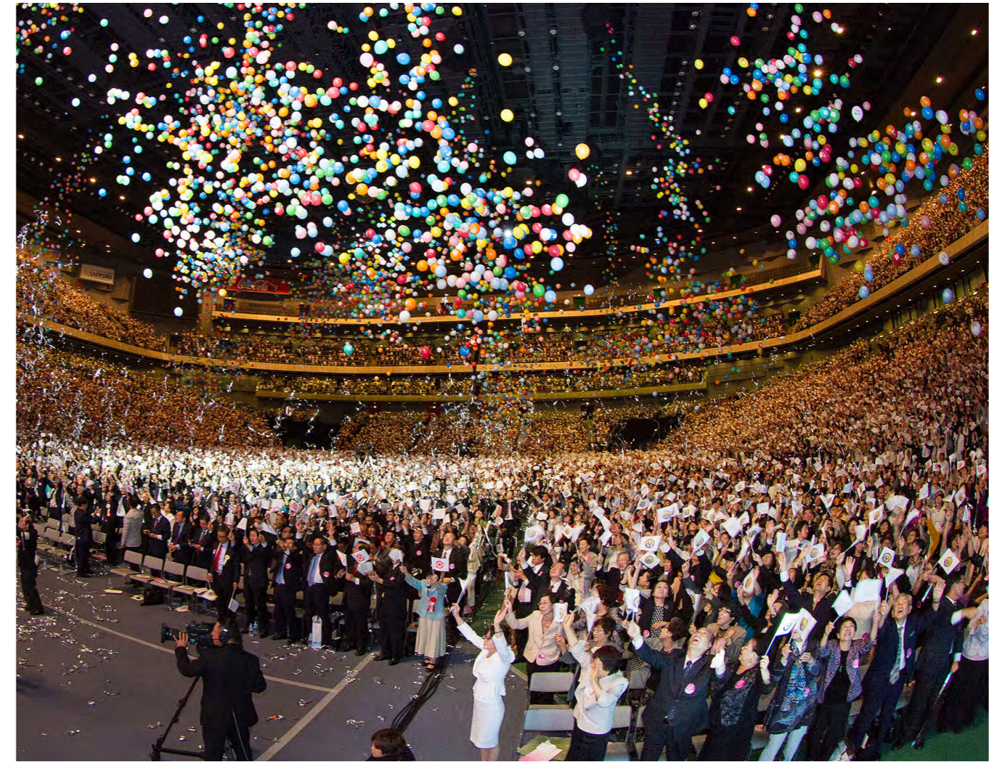
Three cheers of Og mansei concluding the event

“If Vision 2020 is a special dream granted by Heaven, our stance and actions to realize this must also be special.”