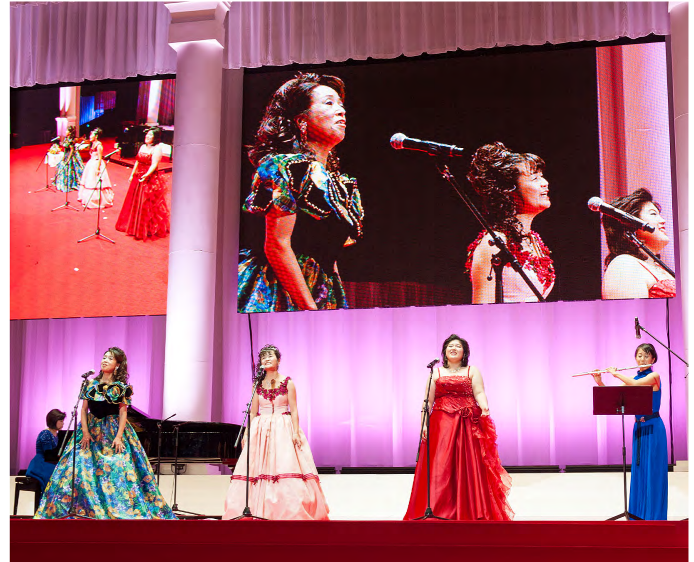
Congratulatory song by a ladies' chorus

who moved to the new continent of America in search of freedom of religion, came to receive Heaven's blessing through their faith and tradition.