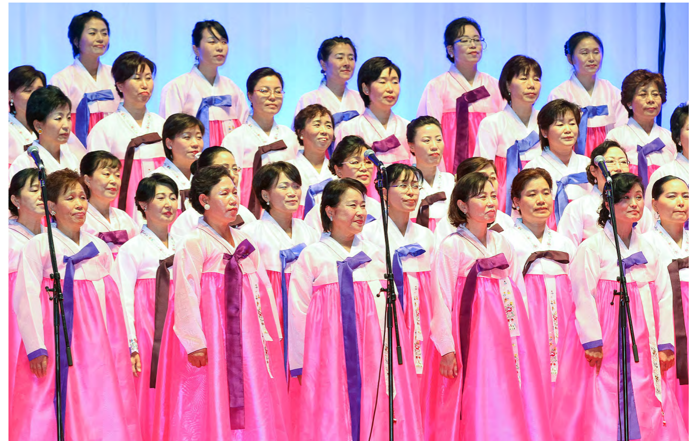
Shin-Tenchi Chorus, comprising Korean and Japanese women

Following the Welcome Remarks, a video entitled “Completing CIG is My Dream,” which