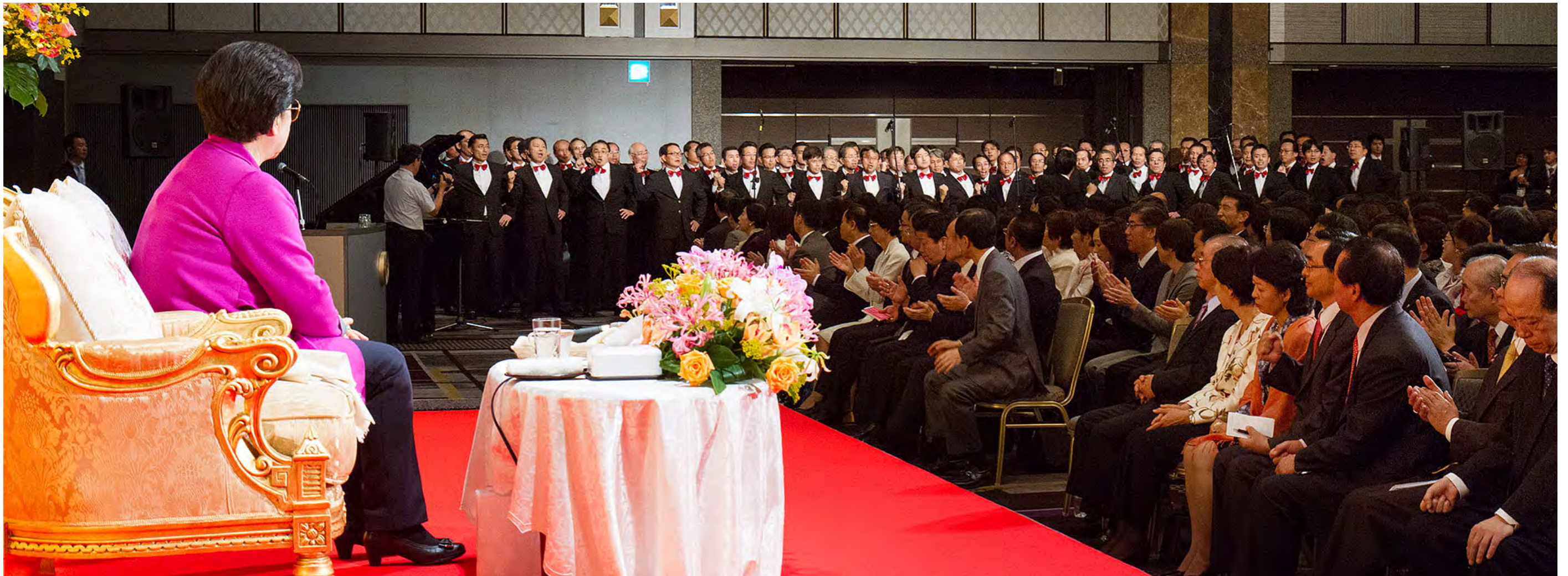
Men's chorus, Sai-no-kuni Fathers, of Region 3

Participants realized once again through True Mother the fact that, "Parents always look at their children with the 'eyes of possibility.'" As the heart of forgiving, encouraging, expectation and hope are fused, the participants were all able to feel that, although Japan has points that fall short of the standard desired by Heaven, True Mother's gaze embraced all, forgave, encouraged and looked with expectation toward the victorious future, for which Japan would do its best.