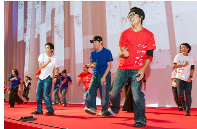
SEIWA CREWS, a dance team of 20 some members