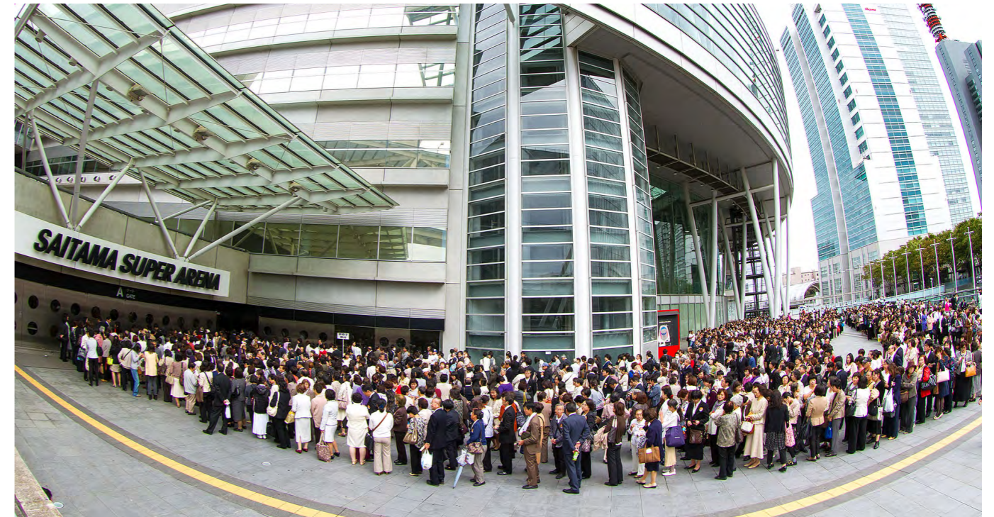
Participants in lines at the rally's venue