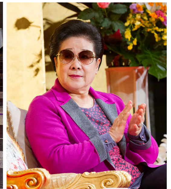
True Mother watches a performance