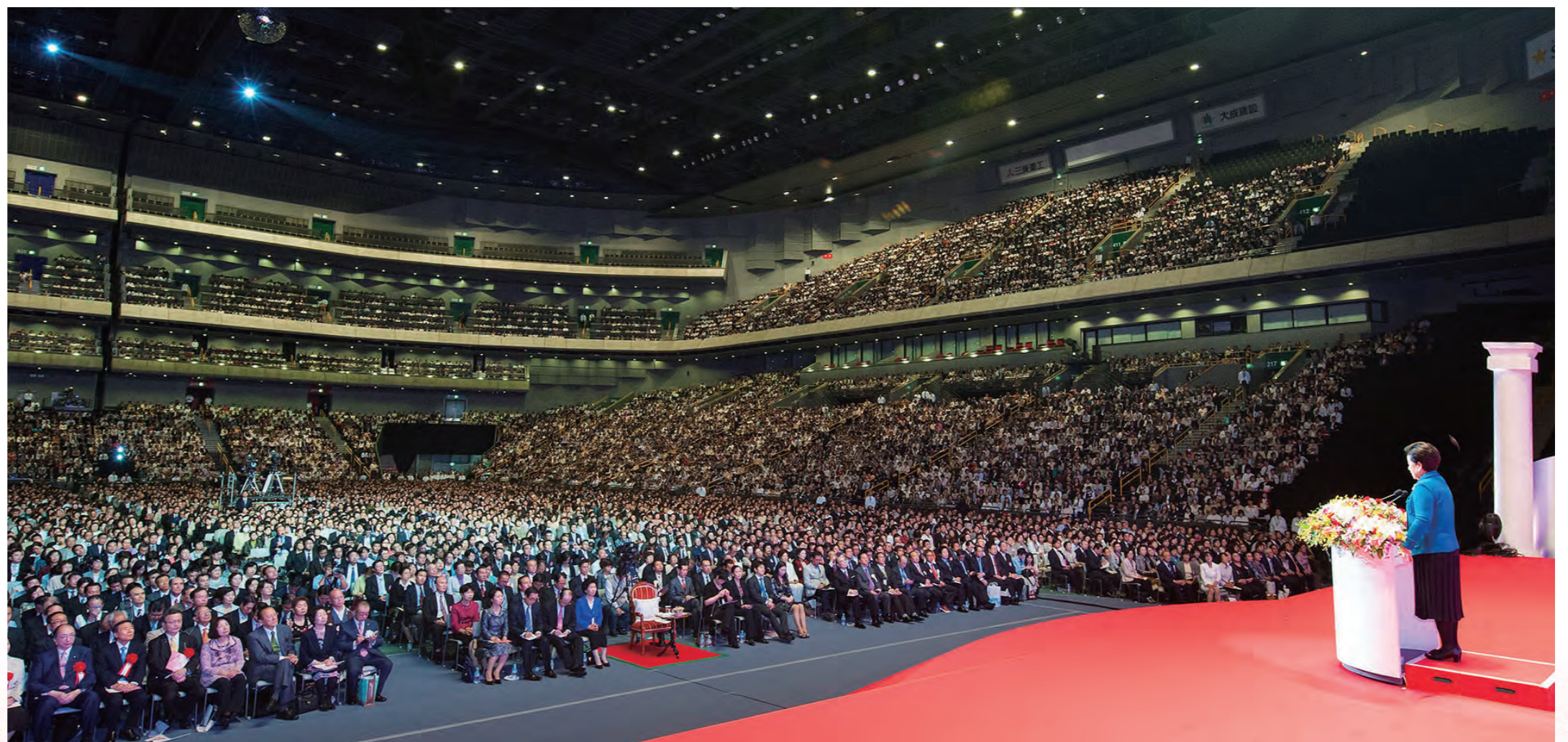
True Mother gives a historic speech to 20,000 participants

On October 16, 2013, after Typhoon Wipha left the skies of Saitama prefecture, where the Commemorative Rally of the 55th Anniversary of the Unification Church Mission in Japan and 54th Anniversary of the Church Founding was to be