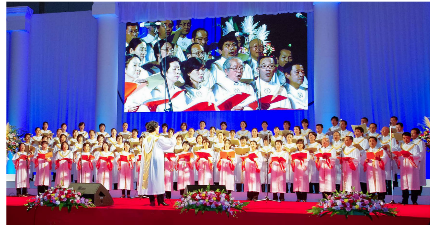
Symphony No. 9 - 'Praise God's Love' by Nagoya Region's choir