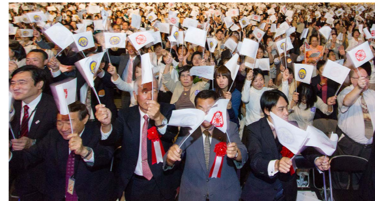
Waving flags to welcome True Mother