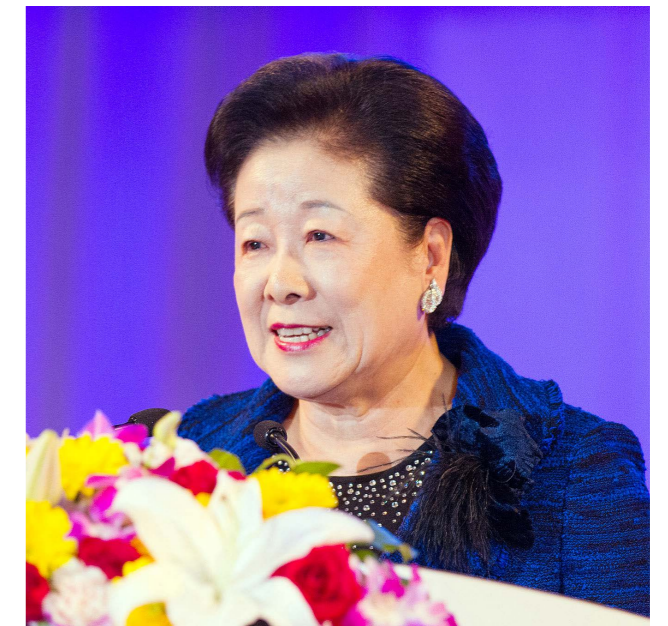
True Mother giving her message

This theory suggests why True Mother loves blessed families and Unificationists in Japan.