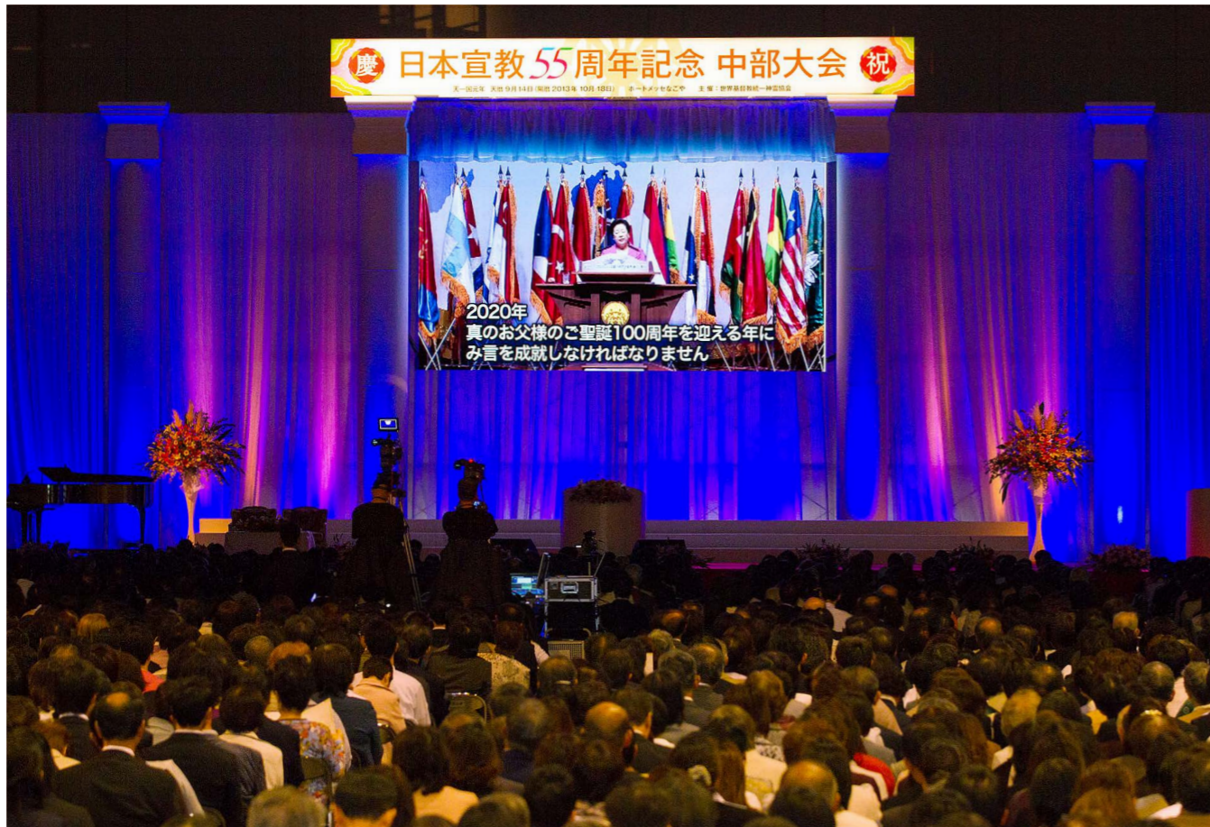
A view from the Central Japan Rally