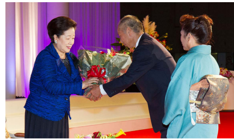
The Mukami couple offers a bouquet of flowers to True Mother