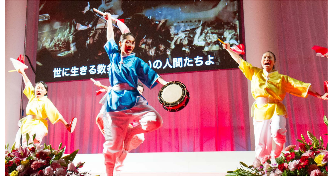
Energetic drum dance by members of 7th and 8th Regions