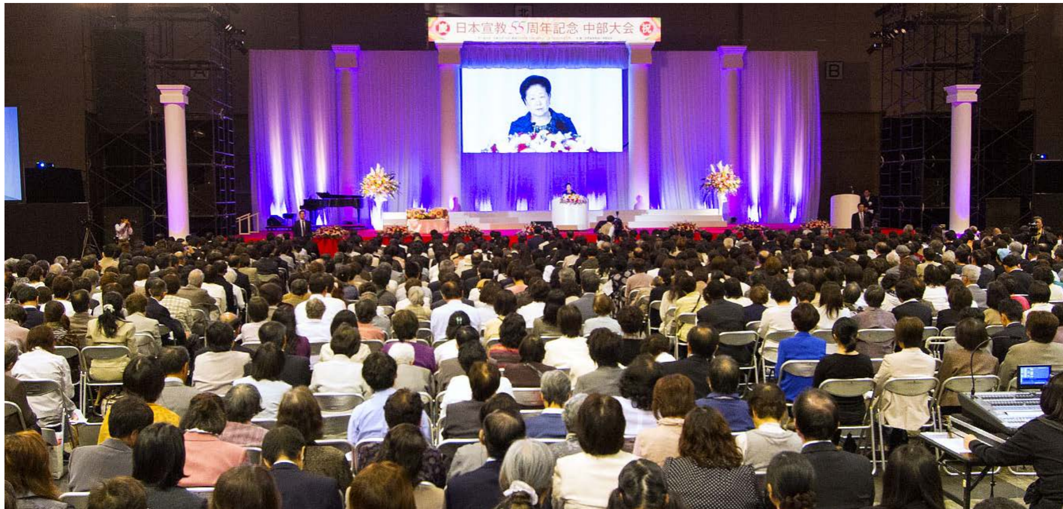
About 10,000 people took part in Central Japan Rally