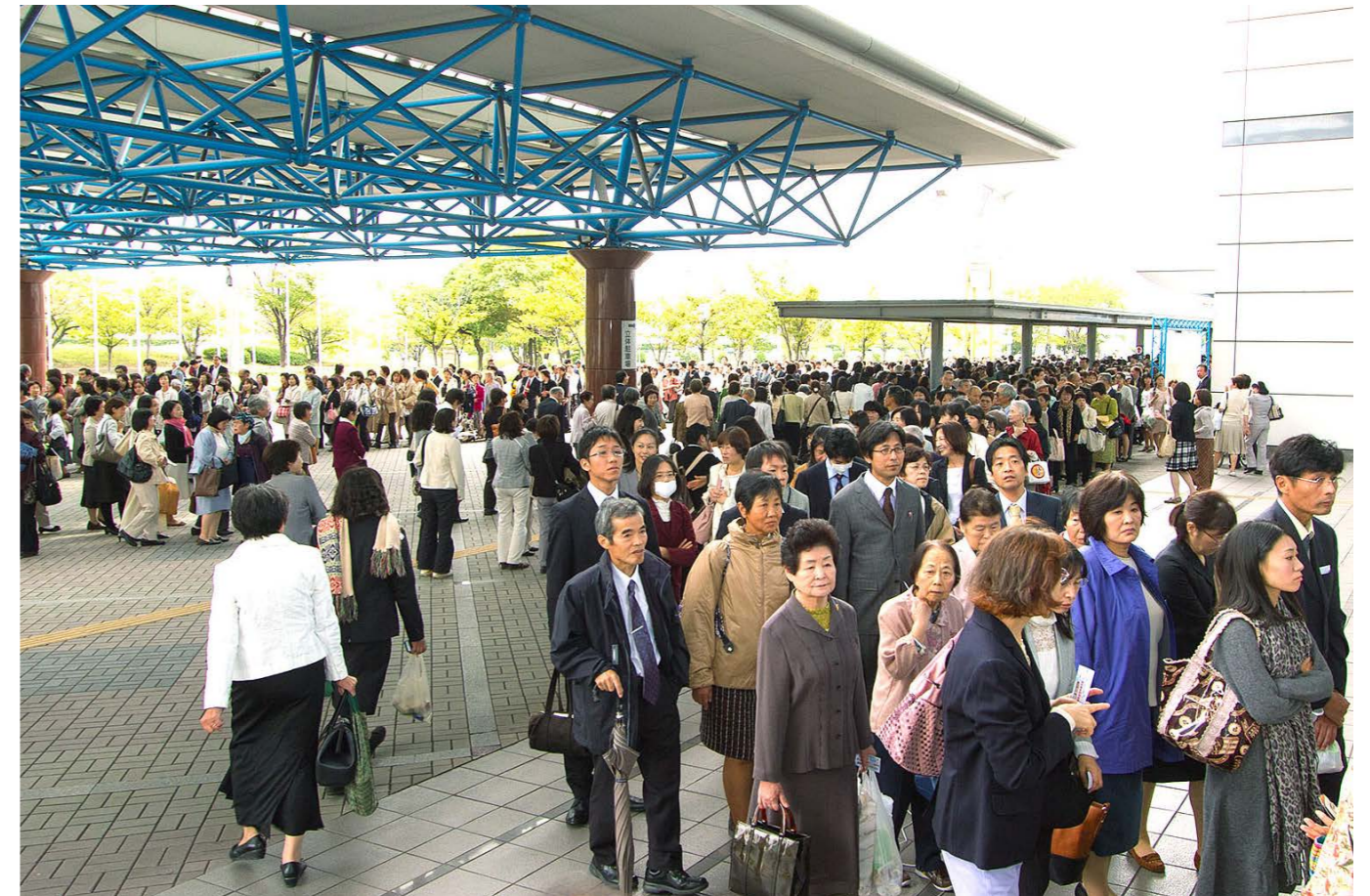
Participants waiting in a long line