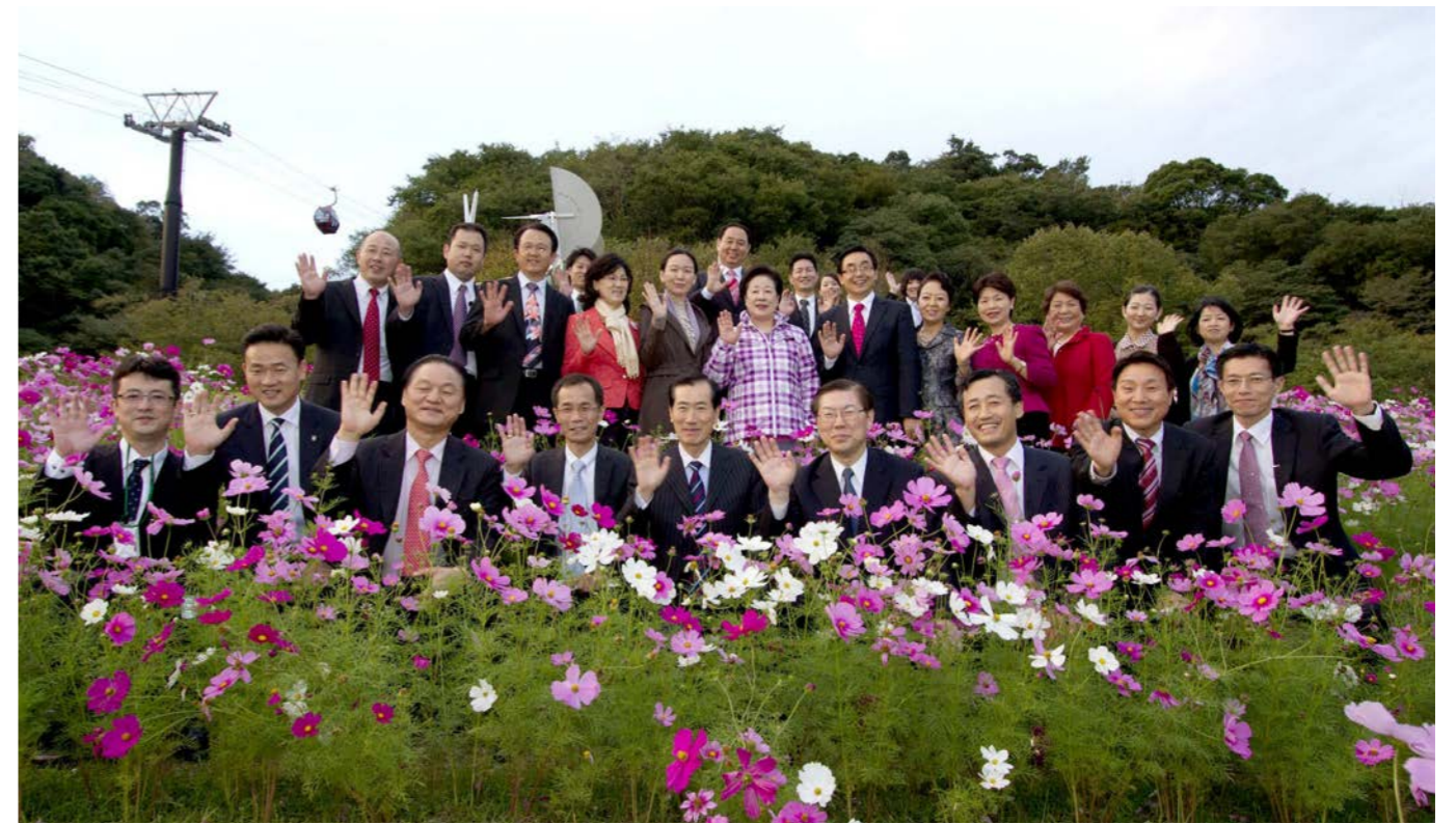
A commemorative photo after the rally was over