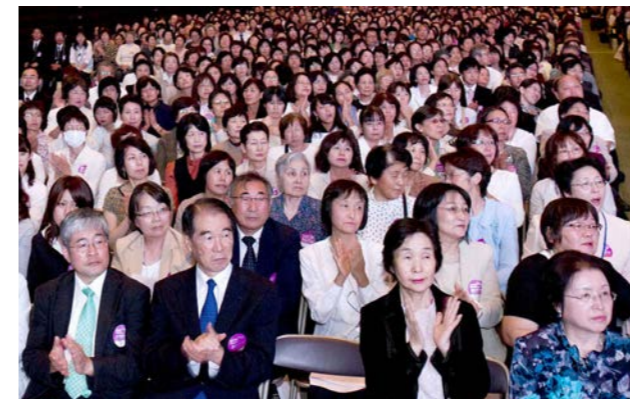
Audience giving passionate applause to True Mother