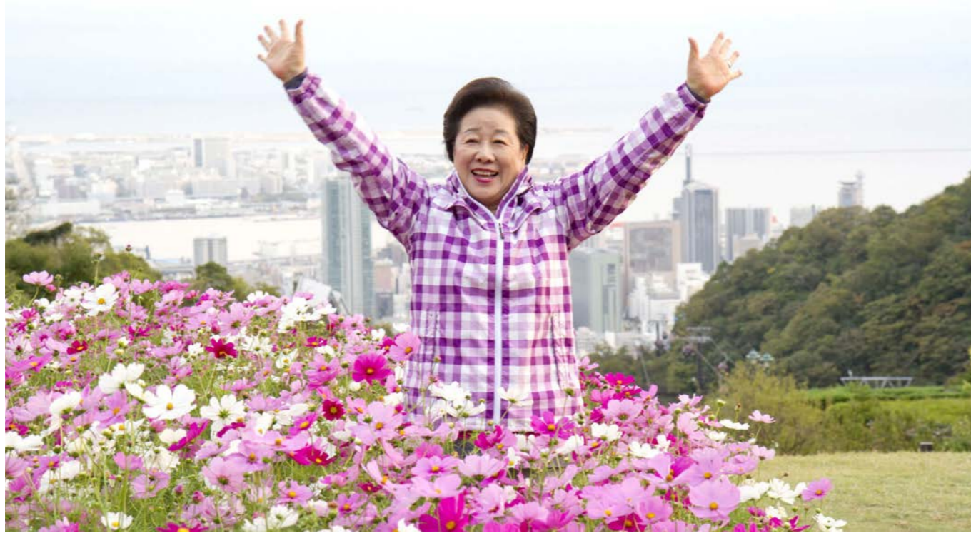
Cosmos flowers in full bloom at Nunobiki Herb Garden