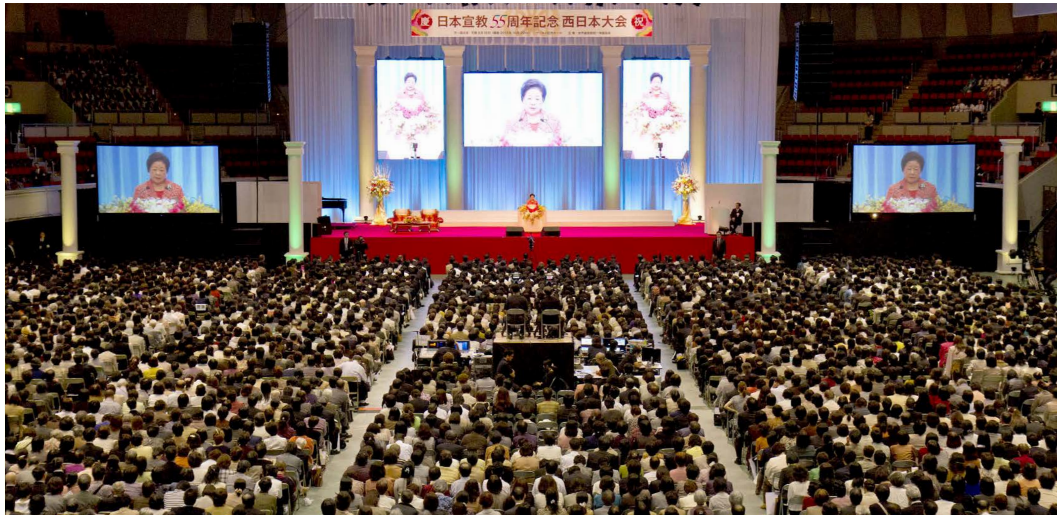
West Japan Rally Commemorating 55 years of Unification Mission in Japan