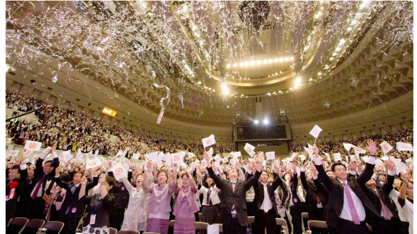
Four cheers of Og mansei concluding West Japan Rally