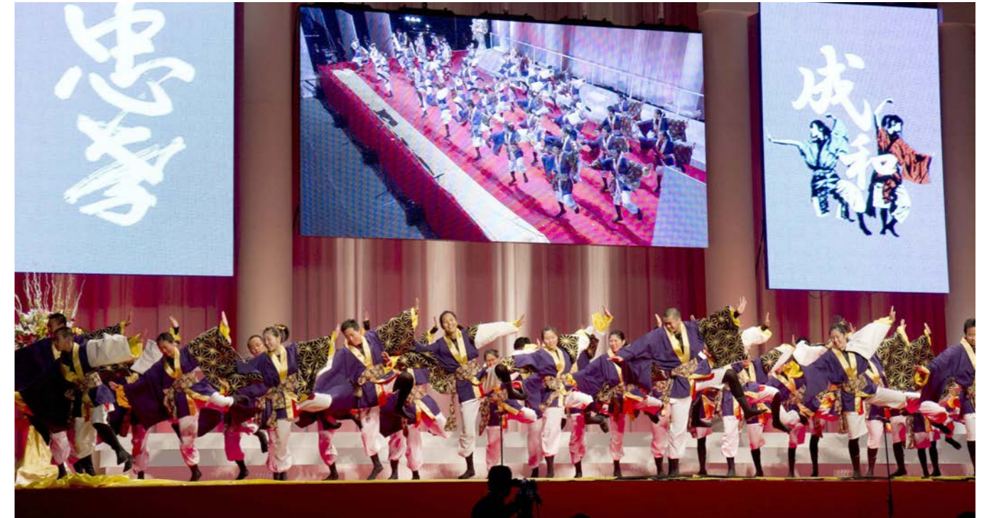
Middle and high-school students performing a dynamic group dance