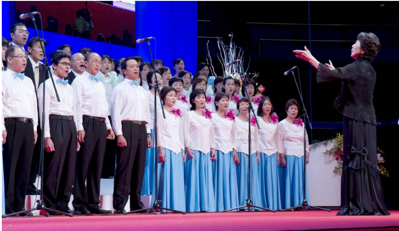
West Japan Choir performing a chorus of 'Tears'