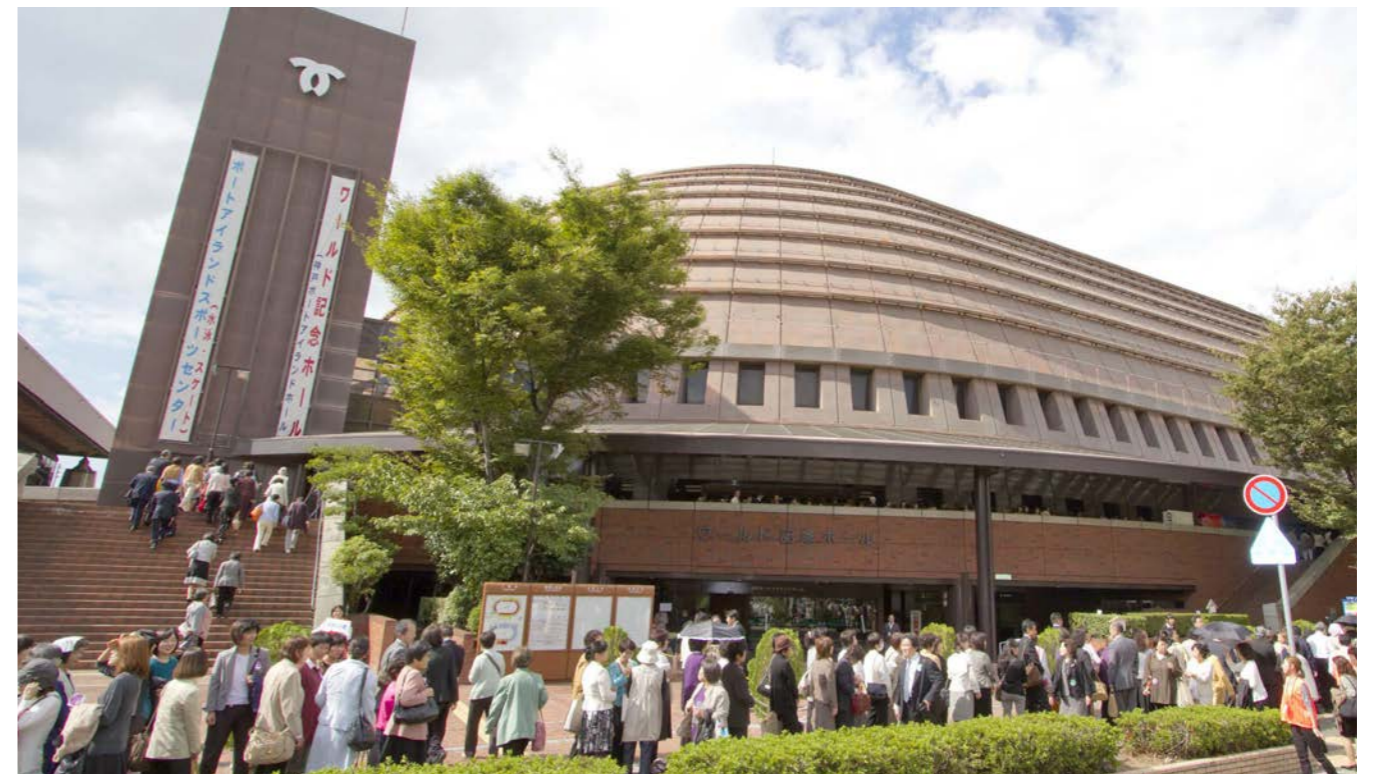
long lines of participants

True Mother emphasized that we should not forget the elder blessed families and those who had suffered and devoted themselves in the fields of the providence until the church has developed to this level today. She also pointed out that the special blessing was granted by True Parents to Japan so as to create an environment to take care of over 40,000 second