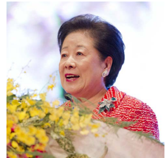
True Mother speaking words of truth

Water symbolizes life, as a human body contains water by nearly 70 percents of the body weight. Without water, life cannot sustain. Incidentally, among