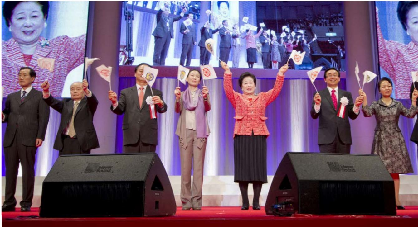
Three cheers of Og mansei with determination for Vision 2020