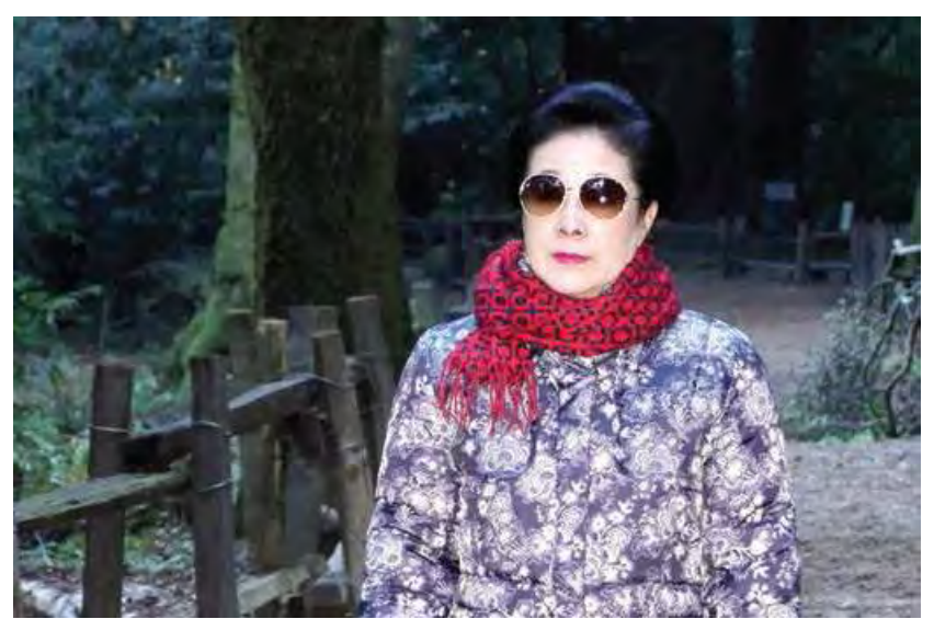
True Mother taking a stroll through the redwood forest