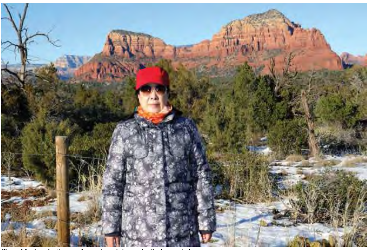
True Mother in front of a red rock butte in Sedona, Arizona