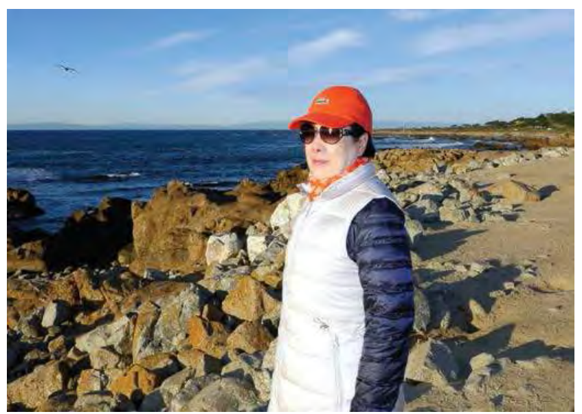
Santa Barbara Beach