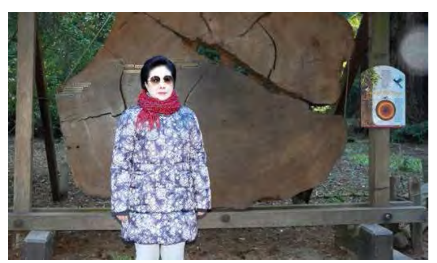
True Mother in front of a section of felled tree, 9,977 years old