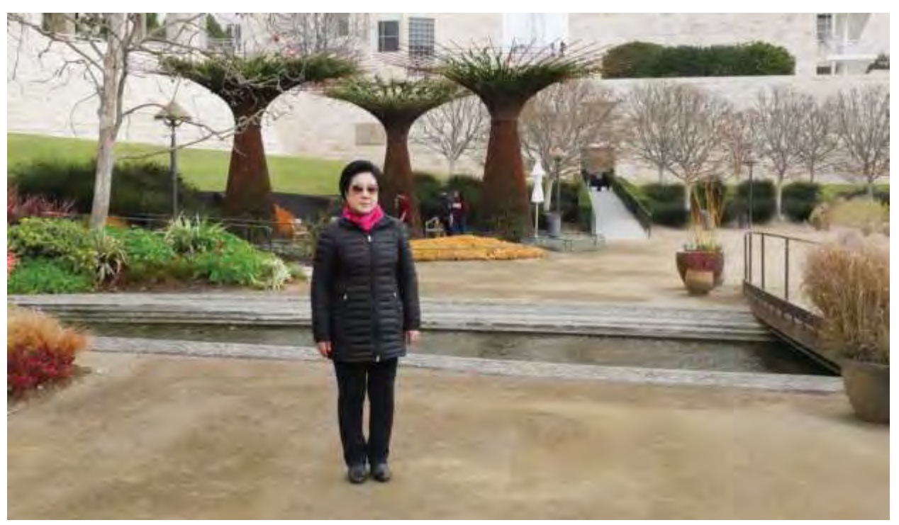
True Mother visiting the J. Paul Getty Museum as preparation for creating Cheonji Sunhak Won