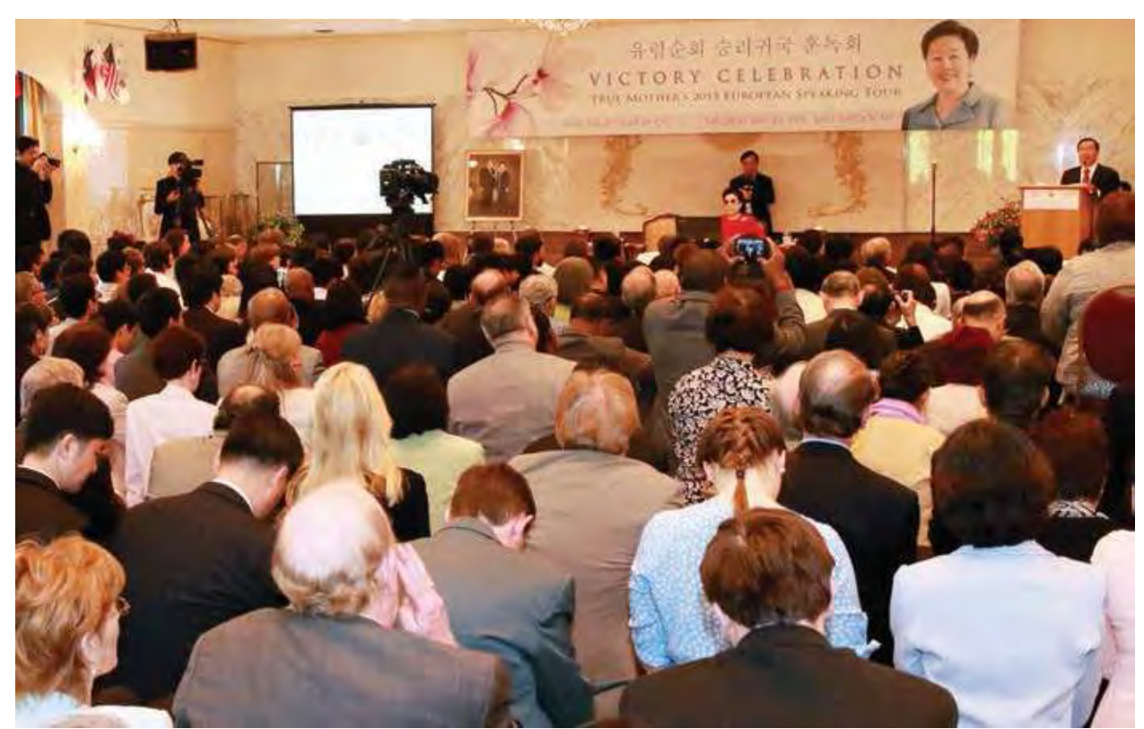
True Mother speaking during Hoon Dok Hae in East Garden

The Israelites two thousand years ago were meant to welcome the Messiah and to then create a nation. This was during the time of the Roman Empire, which was the Cain world. It was powerful. Rome was the center of the world at that time. I have seen the ruins in Rome; Roman ruins exist in the Alps. That is how powerful the Roman Empire was. By comparison, the nation of Israel was tiny. Their wish was to welcome the Messiah and then to use the foundation of the Roman Empire to realize one world centered on the Roman Empire.