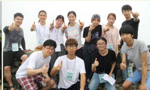
Workshop participants at to the holy ground on Mt. Bonghwa

The Collegiate Association for the Research of Principle in Korea (hereafter CARP Korea) held various events on the occasion of the third anniversary of the Universal Seonghwa of Rev. Sun Myung Moon, the True Parents of Heaven, Earth and Humankind. These events included the "2015 Special Summer Workshop" (hereafter Special Workshop), CARP's Journey for Hope, College Students' Visit to Mt. Baekdu and the First Competition for Church Songs. Among the events held by CARP to inherit True Parents' tradition and pioneer the future of the movement were the "2015 National Seonghwa Camp" and the "World Assembly for Youths and Students."