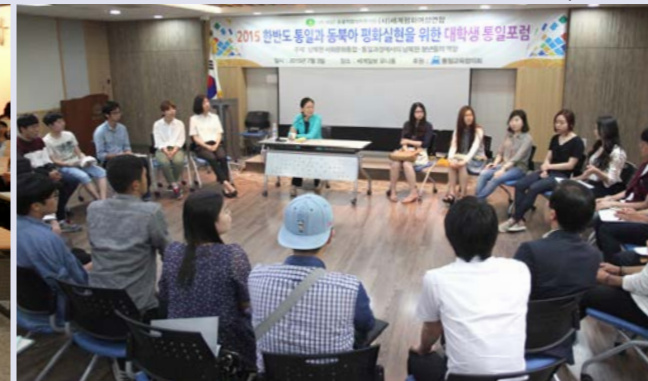
A scene of the unification forum held for university students