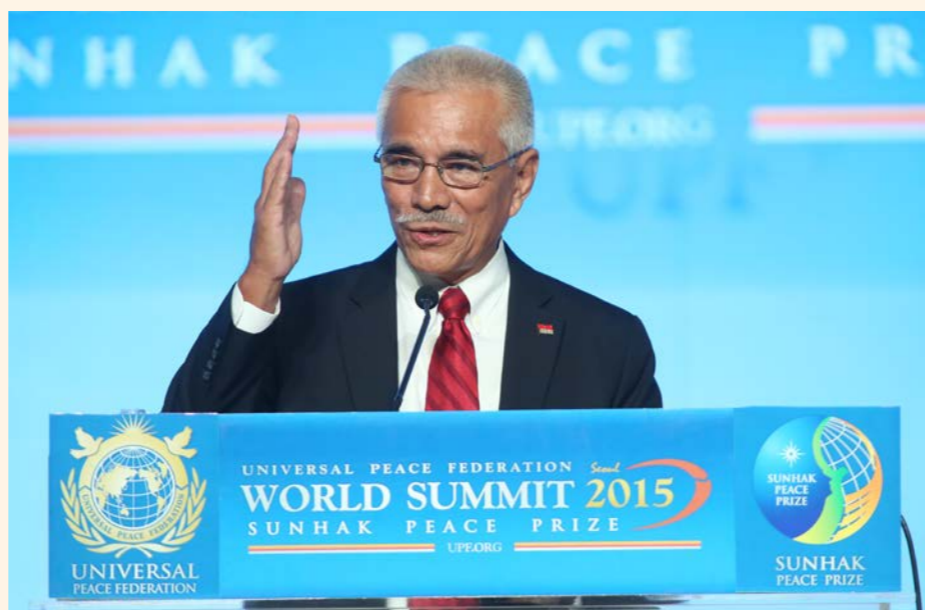
Co-winner President Anote Tong

For the sake of our descendents, we need to do more than be aware. We need to take action and find a comprehensive solution that provides peace and security without causing harm to anybody. We need to take action that secures the future of our planet and our worldwide community, and we need to take action that does not disregard any of our people. More than anything else, we must seek urgent action for the sake of the weakest people in the countries on