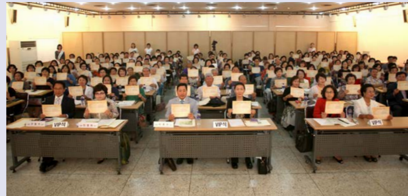
Group photos taken after everyone signed the petition