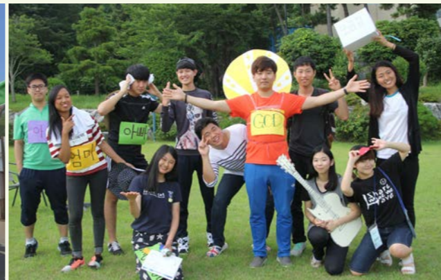
Workshop participants taking part in team projects