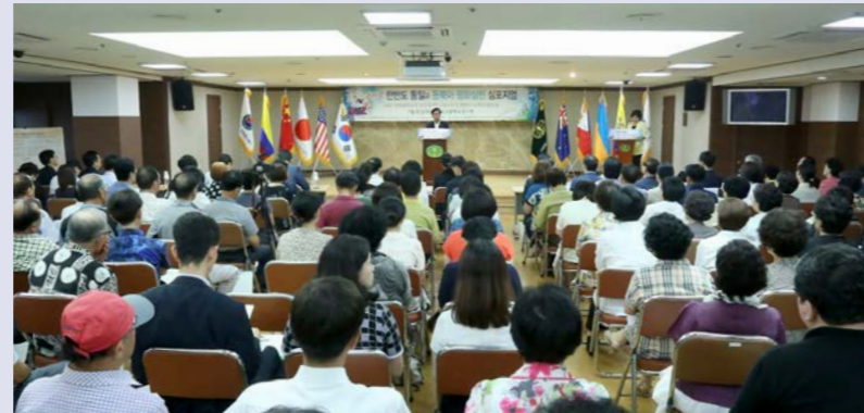
A panorama of the 2015 Symposium for the Unification of the Korean Peninsula and for the Realization of Peace in Northeast Asia