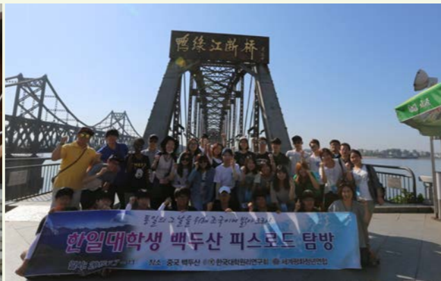
Photos taken at the Yalu River railroad bridge