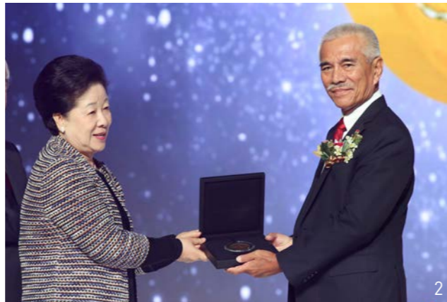
2. True Mother presents the Sunhak Peace Prize to President Anote Tong of Kiribati, a co-winner of the Sunhak Peace Prize