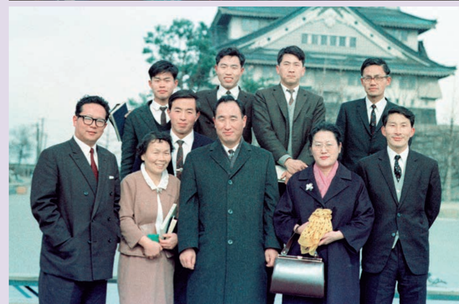
1. Day of Hope banquet held in Tokyo on February 1972 2. True Father speaking at a members' rally held in Saitama 3. 1965 - After choosing a holy ground, True Father took this commemorative photo with Japanese leaders that were with him