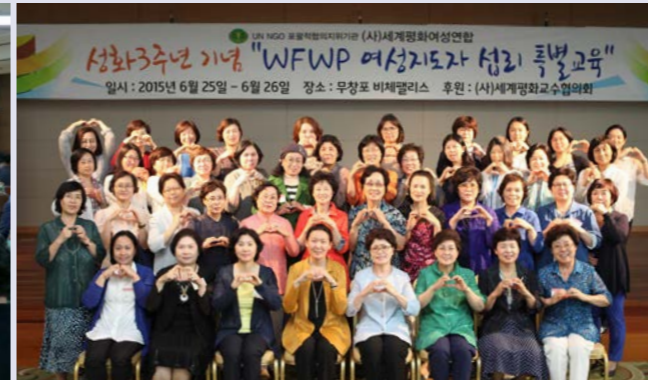
WFWP leaders taking commemorative photos after receiving special education on the providence