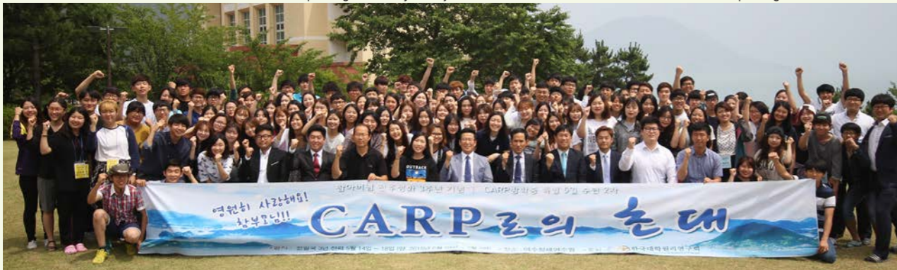
Participants making resolutions to successfully hold the Third Universal Seonghwa Memorial during their 2nd summer vacation workshop held by CARP-Korea