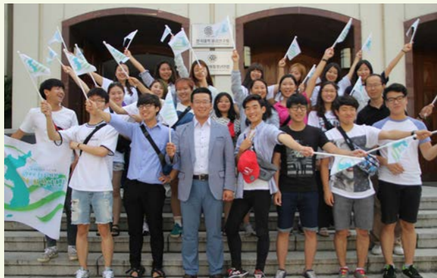
CARP Hope Travel Group takes commemorative photos in front of the CARP center before departing for their journey