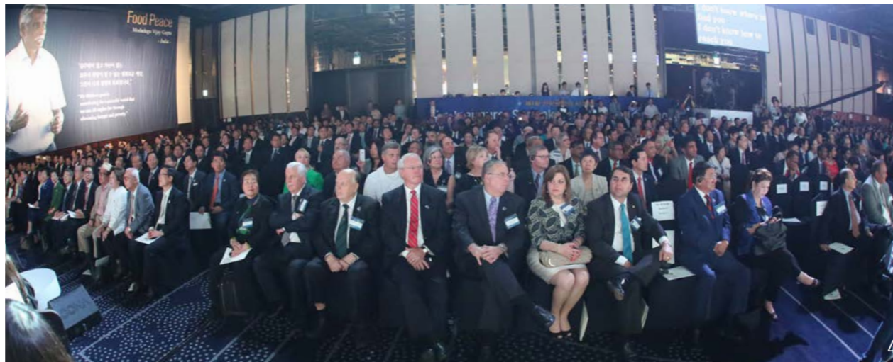
4. Prominent guests from Korea and abroad participating at the First Sunhak Peace Prize Award Ceremony