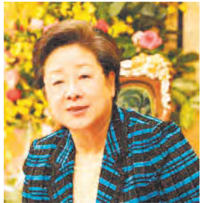
REV. DR. HAK JA HAN MOON

Organizers believe that Mrs. Moon’s message of peace to America is coming