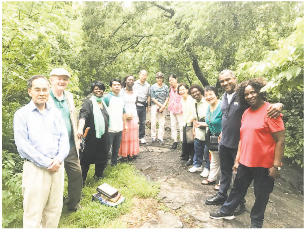
In preparation for the Madison Square Garden event, members of the American Clergy Leadership Conference gather in Central Park for prayer.

Stallings made national headlines back in 1990 when he appeared on national television on The Phil Donahue Show and