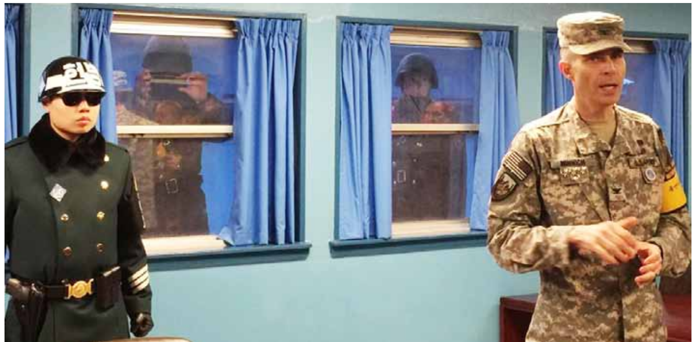
The Washington Times fact-finding delegation toured Pan Mun Jom, the village that straddles the DMZ.