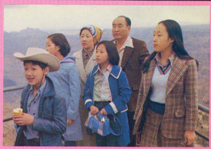
True Family on a cross-country tour at the Grand Canyon in 1977.