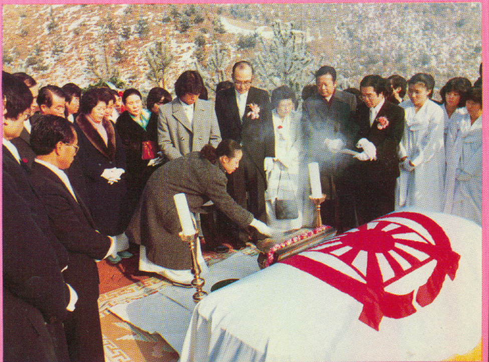
Won Jeun Ceremony at Pa Joo in the mountains North of Seoul.