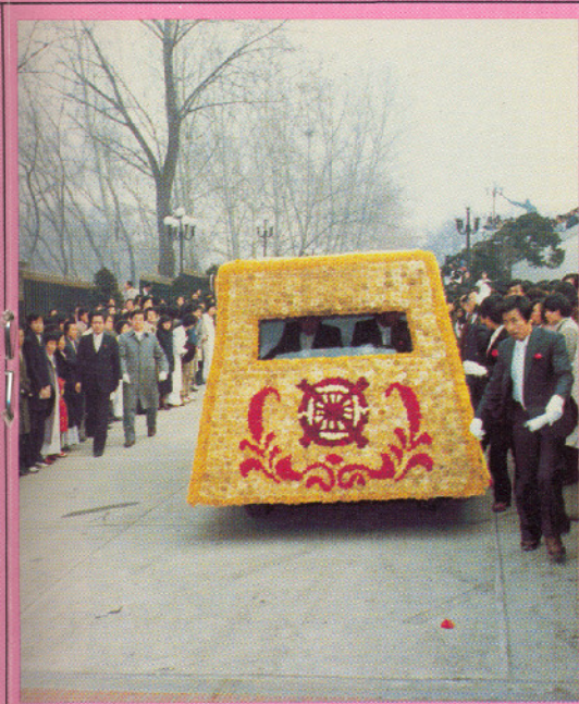
Covered with flowers, Heung Jin Nim's vehicle leaving the Little Angels Performing Arts Center.